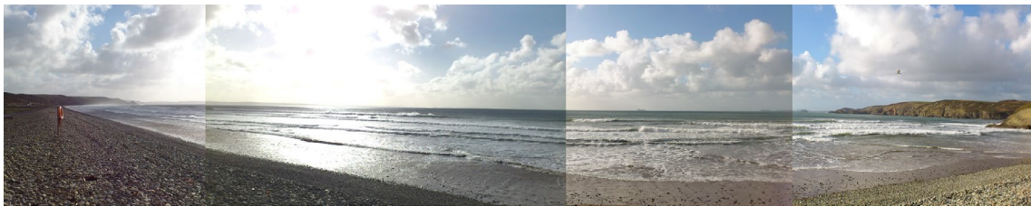
St Brides Bay from Newgale