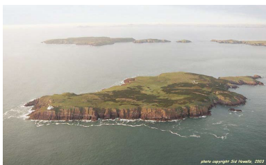
Skokholm from the air