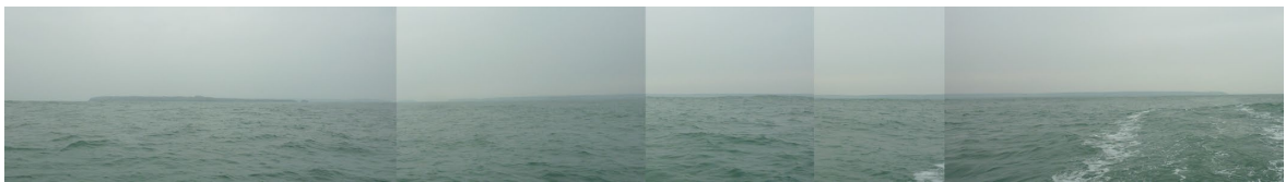
Looking north to Skokholm (left) and St Ann's Head (right) from 2km SE of Skokholm, 3.5 km from shore