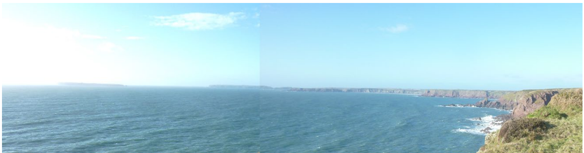
Looking east to Skokholm (left) and Marloes peninsula