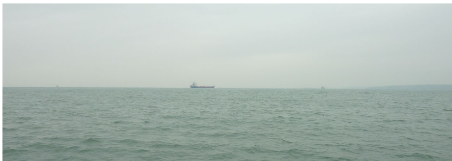
View of area at Sea north east of Skomer