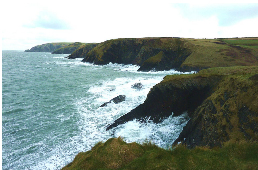
Looking north east from Careg Wylan