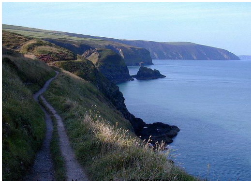
Looking towards Newport Bay