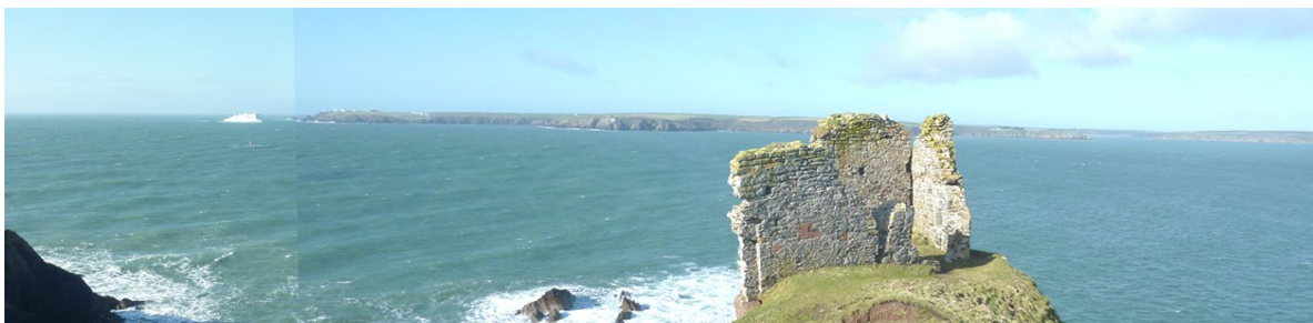
Mouth of Milford Sound from near Rat Island, with ferry off St Ann's Head