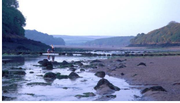
Sandyhaven Pill