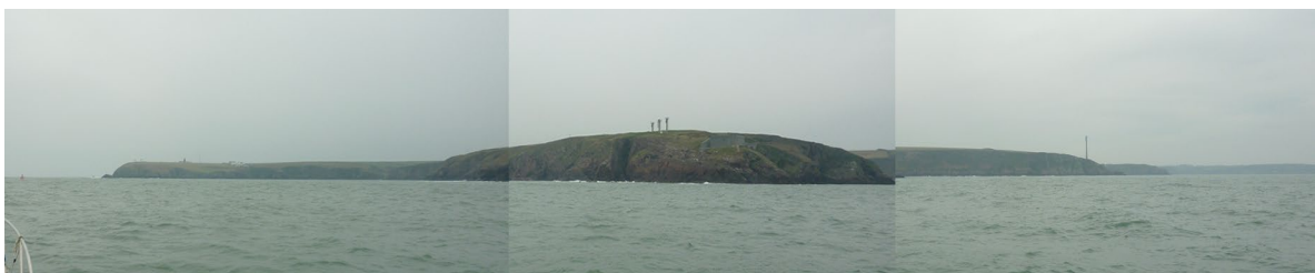
In the mouth of the Sound approx 500m from shore