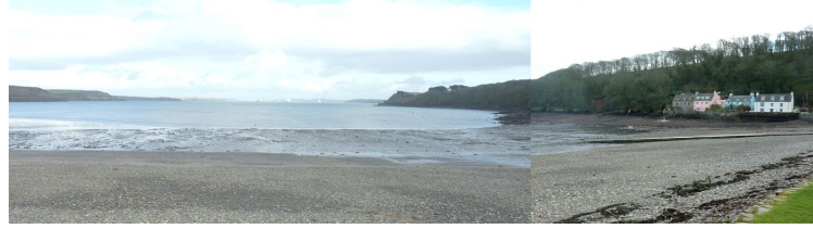
Dale Roads with refinery in distance