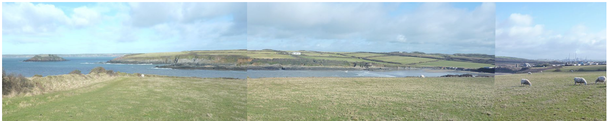
Panorama looking north over Angle Bay, refinery visible on right