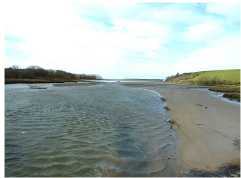
Afon Nyfer estuary