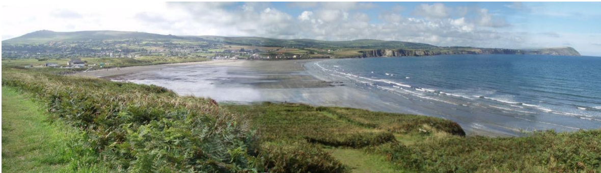
Newport Bay from Trwyn y Bwa (Photo© PCNPA)