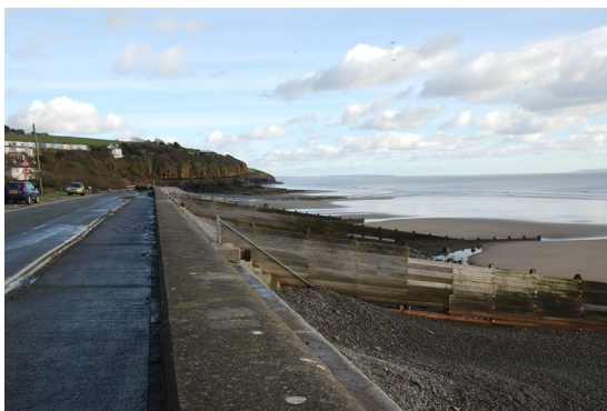
Amroth- sea wall and groynes