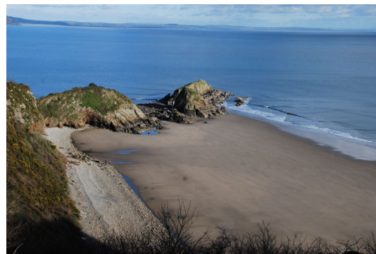
Monkstone Beach illustrating natural beauty