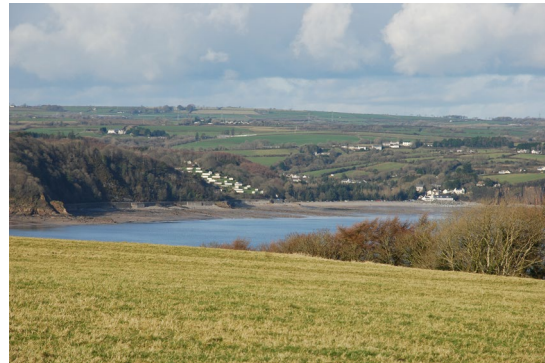
Caravan parks and woodland on the coast- Wiseman's Bridge