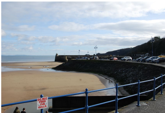
Saundersfoot harbour and beach