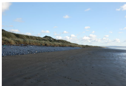
View east along Pembrey Sands