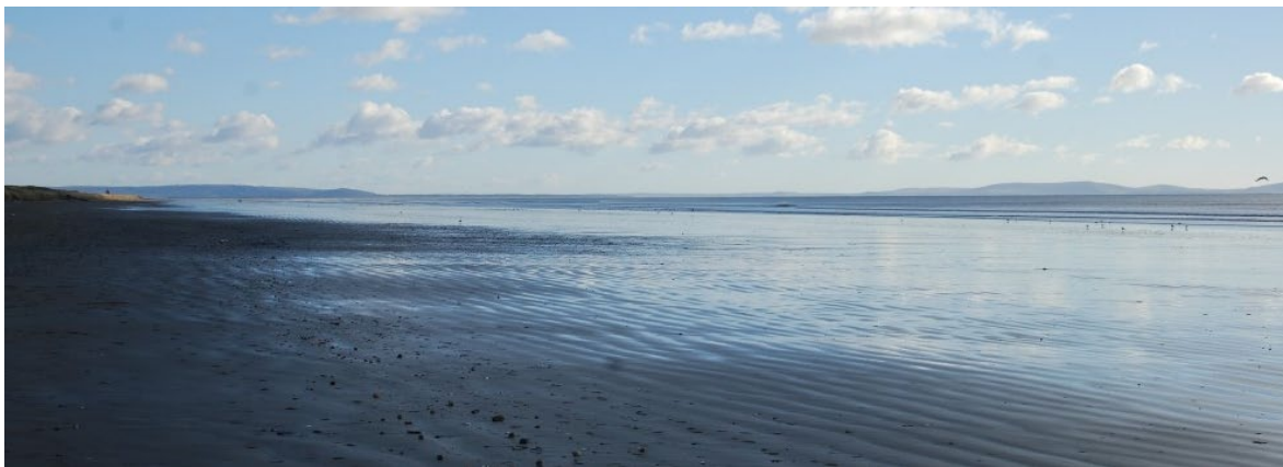
View south east across Carmarthen Bay towards the Gower