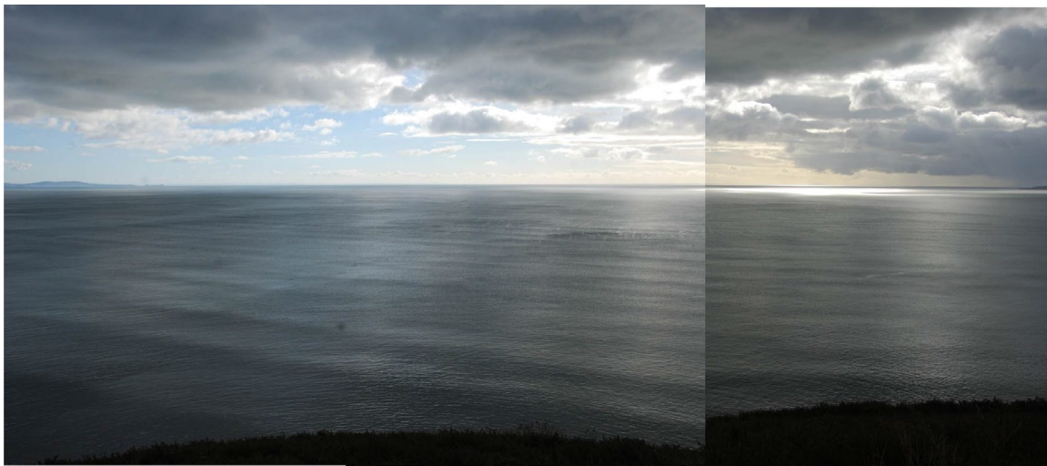
Area visible from Pendine Sands in Carmarthen Bay- Rhossili Downs in Gower lies to east and Caldey Island to west [right]