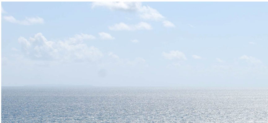
Area between coast and Lundy Island on the horizon [to the left] [View from Gower].