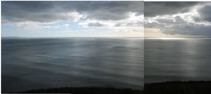
Area over horizon from Pendine Sands in Carmarthen Bay- Rhossili Downs lies to east and Caldey Island to west