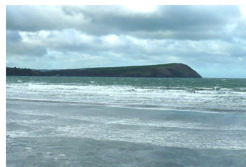
Dinas Head from Newport Sands