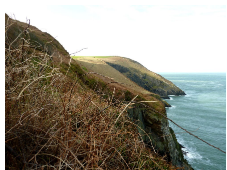
Cliffs on Dinas Head