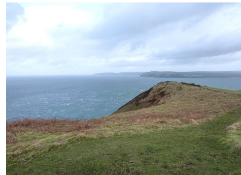
Looking north east from Dinas Head (note disturbed seas of headland)