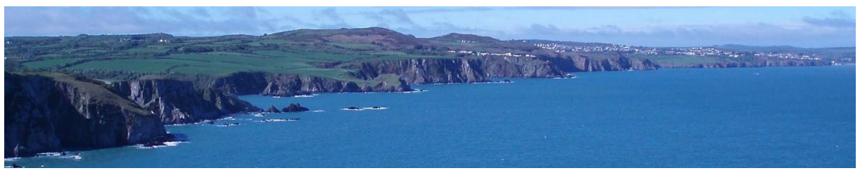
Looking from Dinas Head south-west towards Fishguard