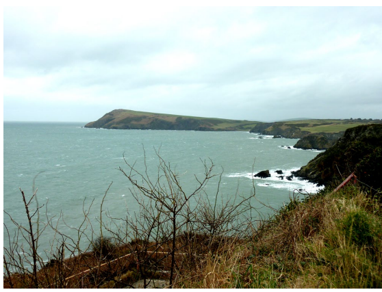
Looking east to Dinas Head from caravan park at Penrhyn