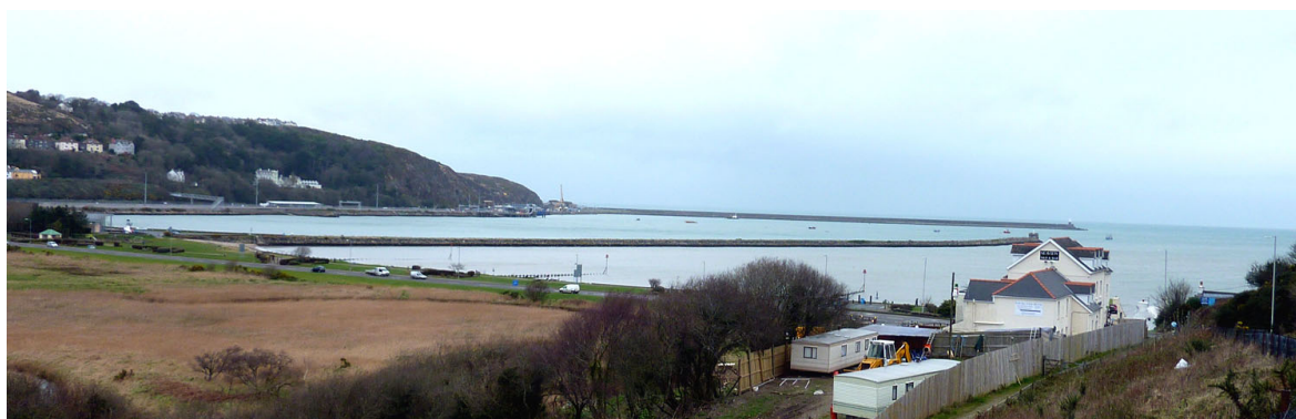
Harbour and ferry terminal at Goodwick