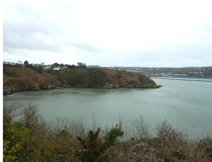
Harbour with Fishguard above and Goodwick in distance