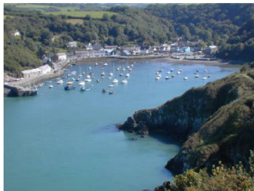
Old Fishguard harbour and Lower Town