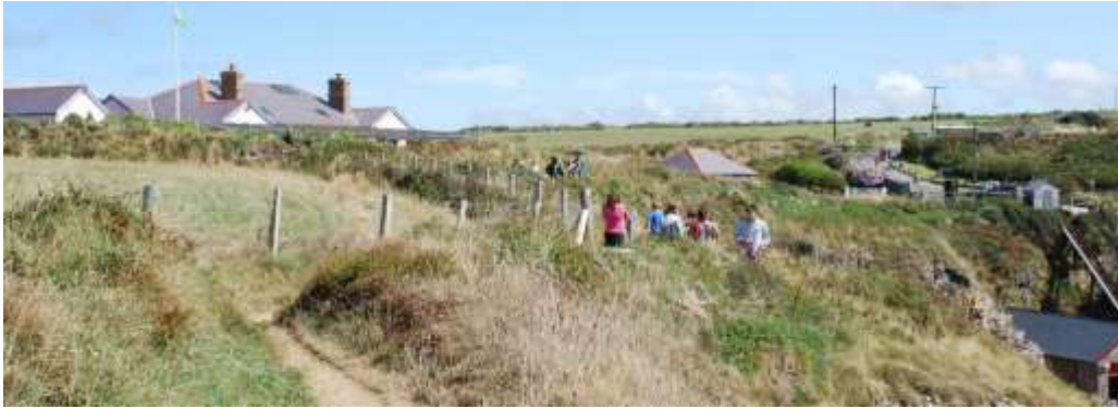
Coast Path at St Justinians- a popular stretch