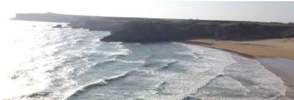
Waves at Broadhaven (South)