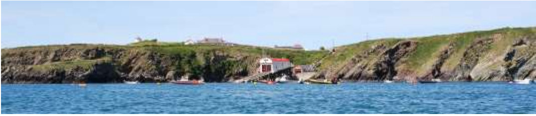
St Justinians from Ramsey Sound