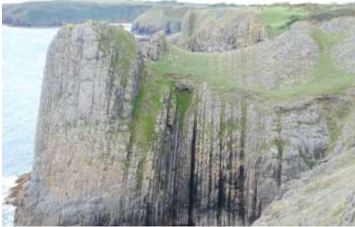
Carboniferous limestone cliffs: Whitesheet Rock