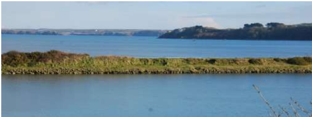
Lagoon at Dale