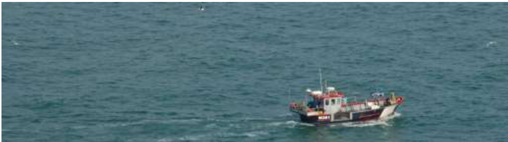
Potting fishing vessel off Strumble Head