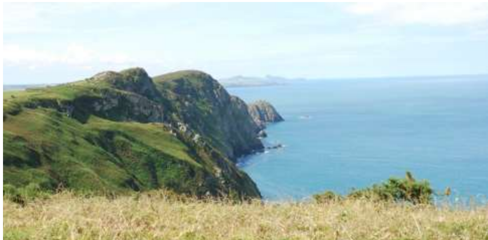
High cliffs at Penbwhchdy

resistant igneous rocks include the spectacular pillow lavas of Strumble Head with cliffs 50mAOD high, the rhyolitic rocks on Ramsey Island, and prominent tors (e.g. Carn Llidi at 181mAOD high -St David's Head gabbro, Garn Fawr at 213mAOD high and Penberi). The islets of the Bishops and Clerks are mostly igneous, representing continuation of this pattern into offshore areas. Local volcanic activity centred on Skomer Island. The Marloes peninsula has extensive coastal exposure of these rocks, while their offshore continuation is shown by the islands/islets of Skomer, Grassholm and the Smalls. The siltstones, limestones and sandstones of the period were formed in warm shallow, fossiliferous seas (brachiopods, corals). Towards the end of the Silurian a transition from marine to non-marine conditions is shown by the change to red-bed deposition of the Old Red Sandstone (e.g. St Anne's Head at 46mAOD high, Freshwater West with its wave cut platform, Freshwater East and Pendine). This continues into the Devonian, represented by red sandstones and mudstones laid down on coastal plains, mudflats, salt marshes and in braided rivers. These terrestrial environments were inhabited by early plants, armoured fish and amphibians. The collision of continents created folds and faults which is widely evident in the cliffs of north Pembrokeshire (e.g. Abereiddi Bay).