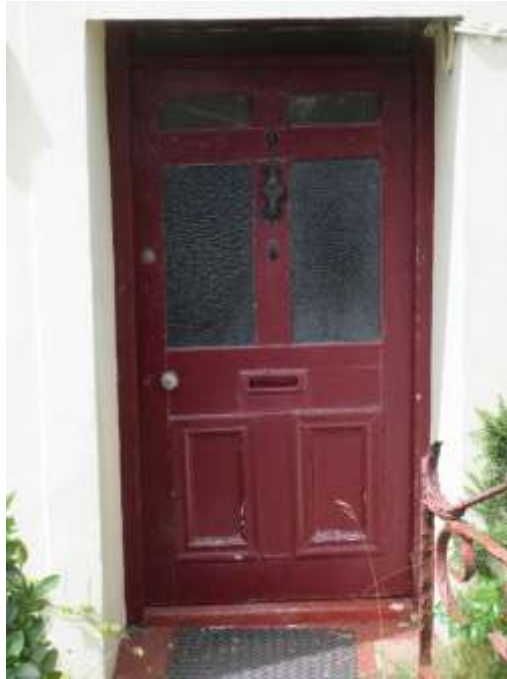
Figure 24 - 6-panel door with later glazing