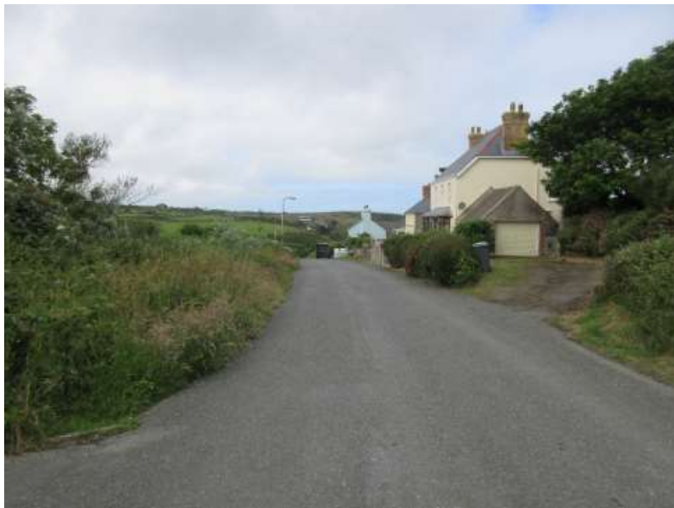
Figure 6 - view west from Ffordd-y-felin