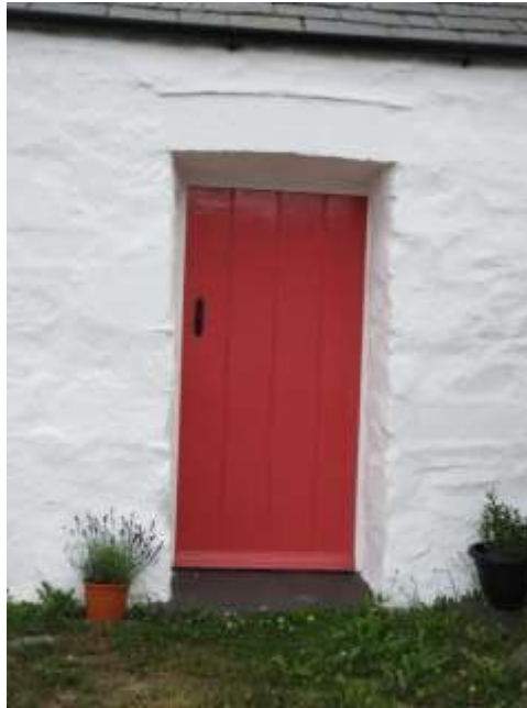
Figure 26 - traditional boarded door