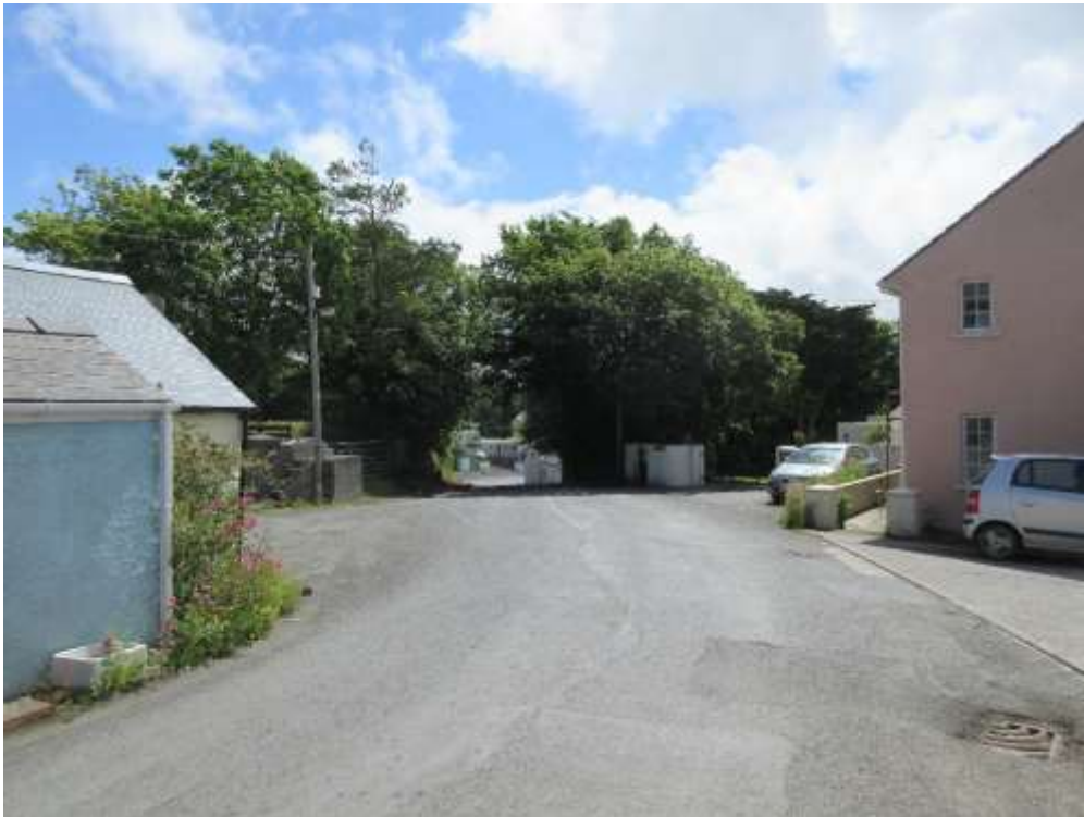
Figure 11 - trees, Ffordd-yr-Afon