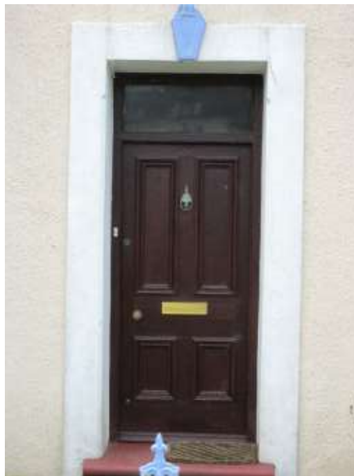
Figure 25 - 4-panel door with overlight