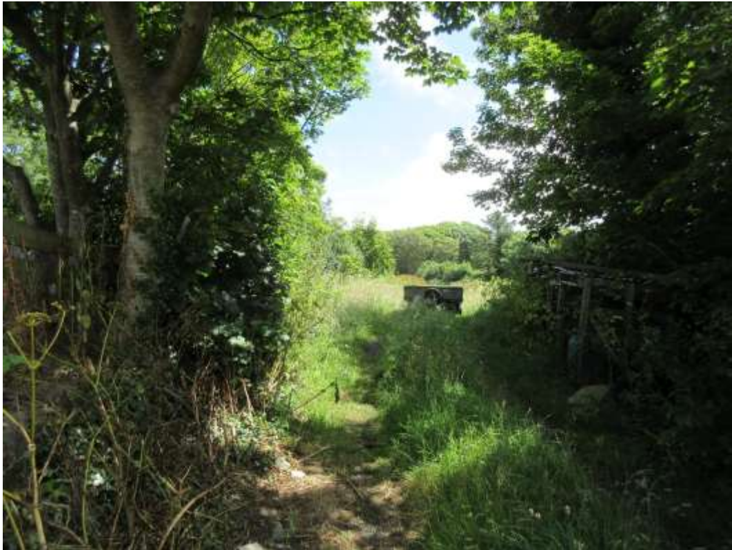
Figure 9 - land east of Ffordd-yr-Afon