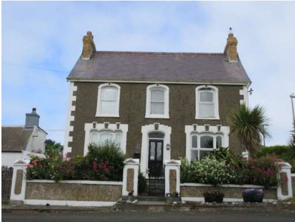
Figure 17 - typical local dry-dash and decorative render