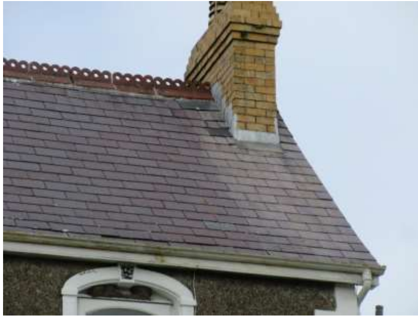
Figure 28 - North Wales slate