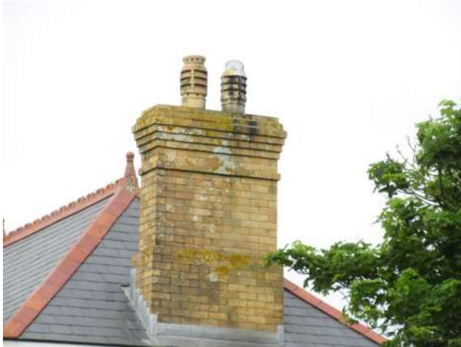
Figure 30 - stack of Flintshire brick