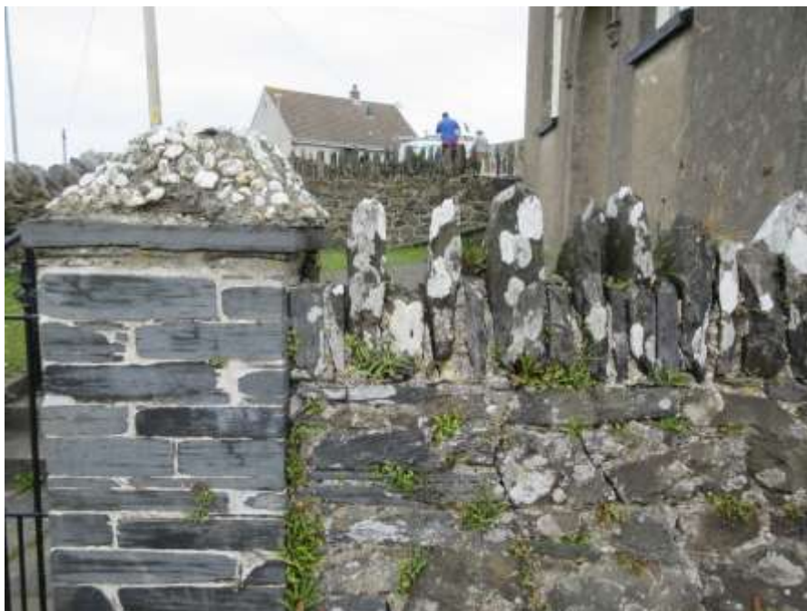
Figure 31 - walls to former Baptist Chapel