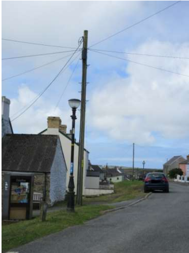
Figure 14 - juxtaposition of sensitive street lighting and intrusive wire-scape