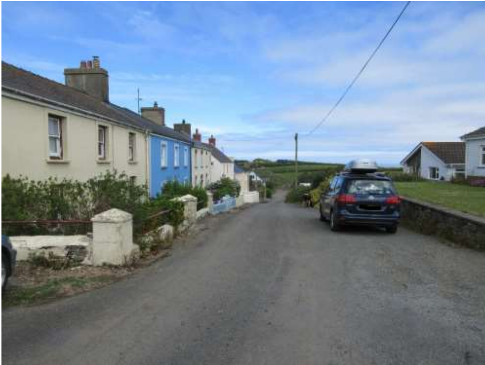
Figure 13 - North End - lack of formal pavements