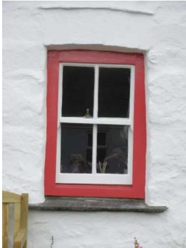
Figure 20 - 4-paned sash