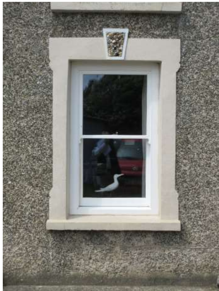
Figure 21 - 2-paned sash