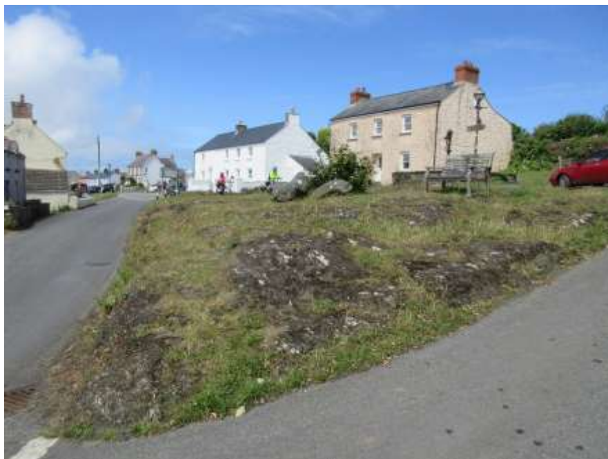
Figure 8 - Carreg-y-Groes