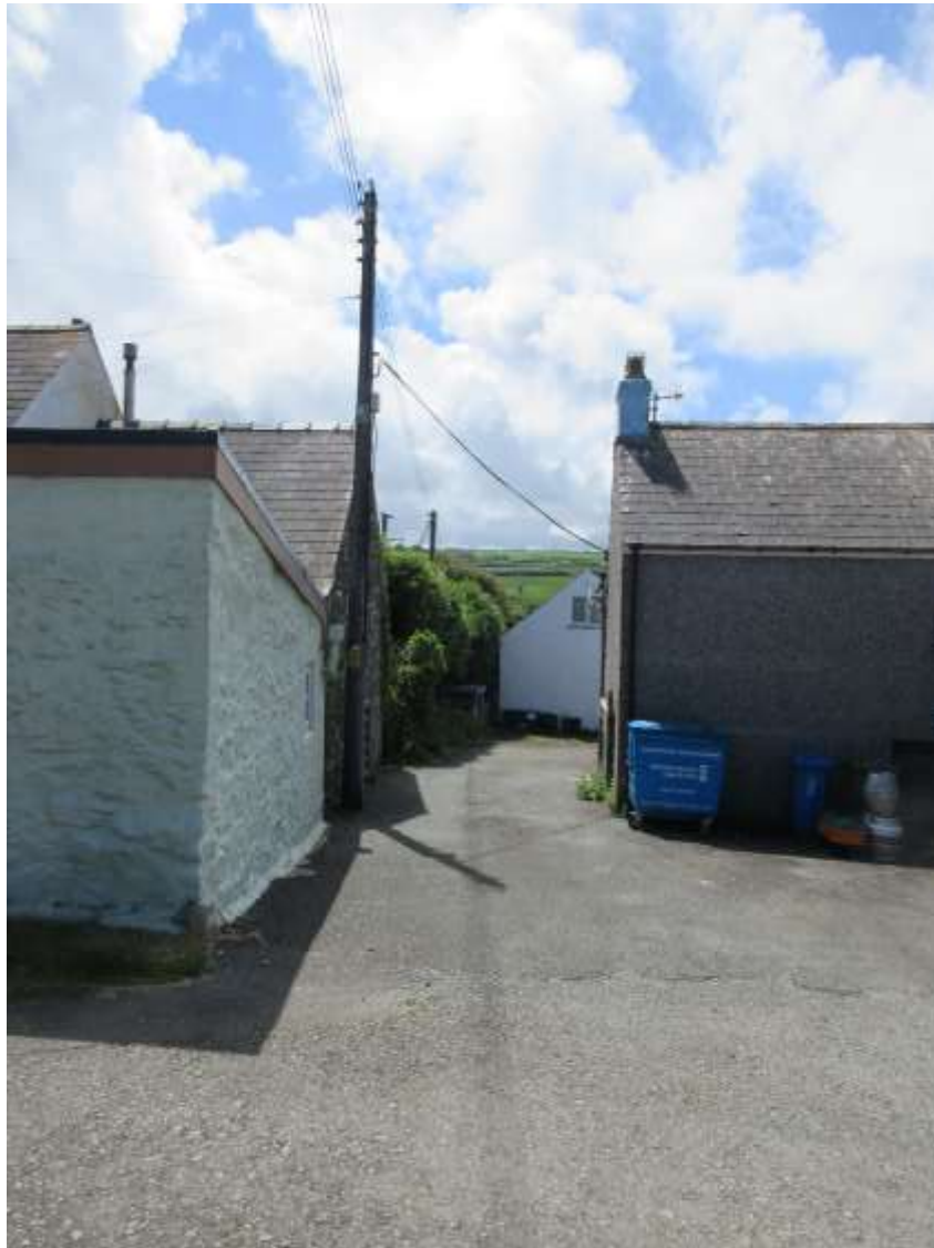
Figure 38 - glimpse southwards between houses, Ffordd-y-Felin