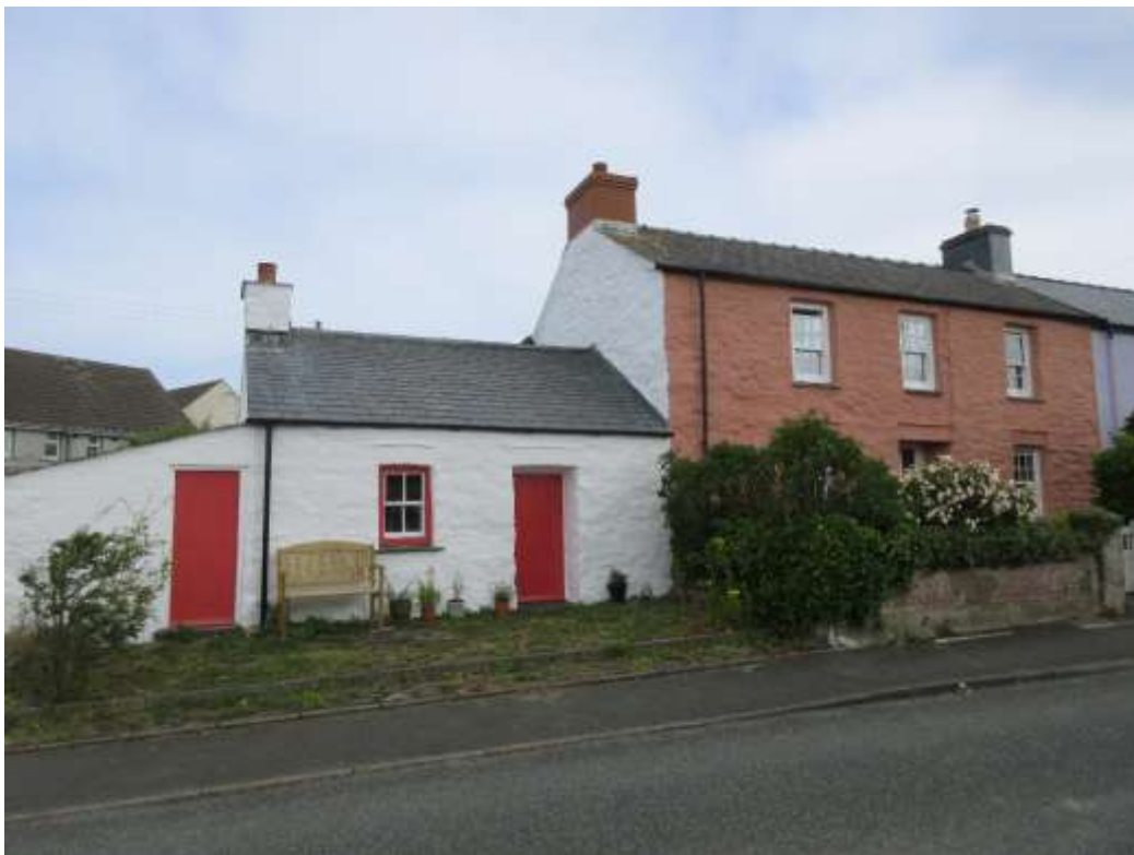
Figure 16 - traditional lime-washed rubble