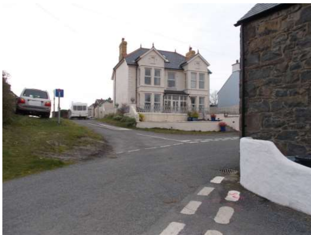
Figure 2 - A landmark building