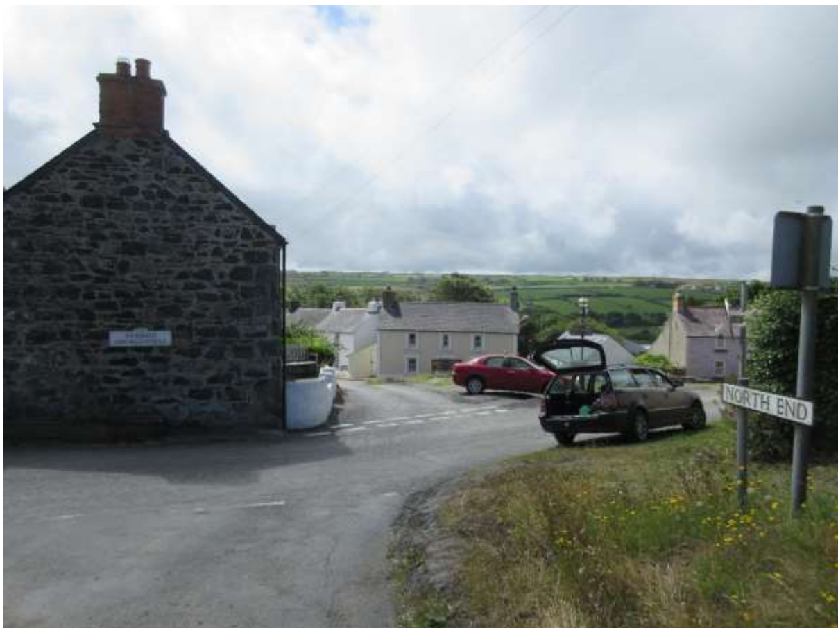
Figure 37 - view from North End