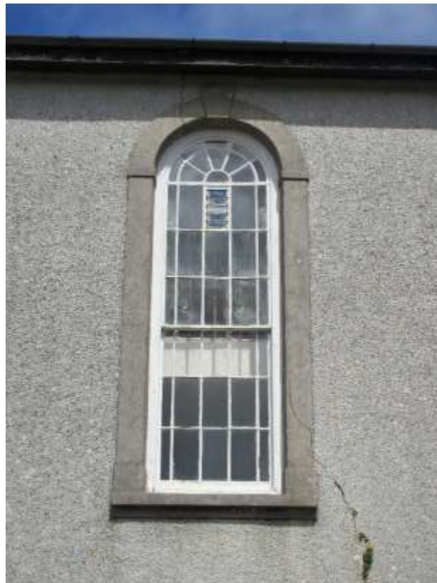
Figure 23 - window of Calvinistic Methodist Chapel