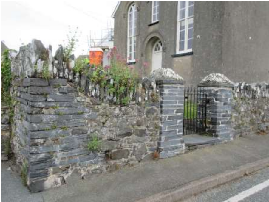
Figure 4 - distinctive historic curtilage, former Baptist Chapel