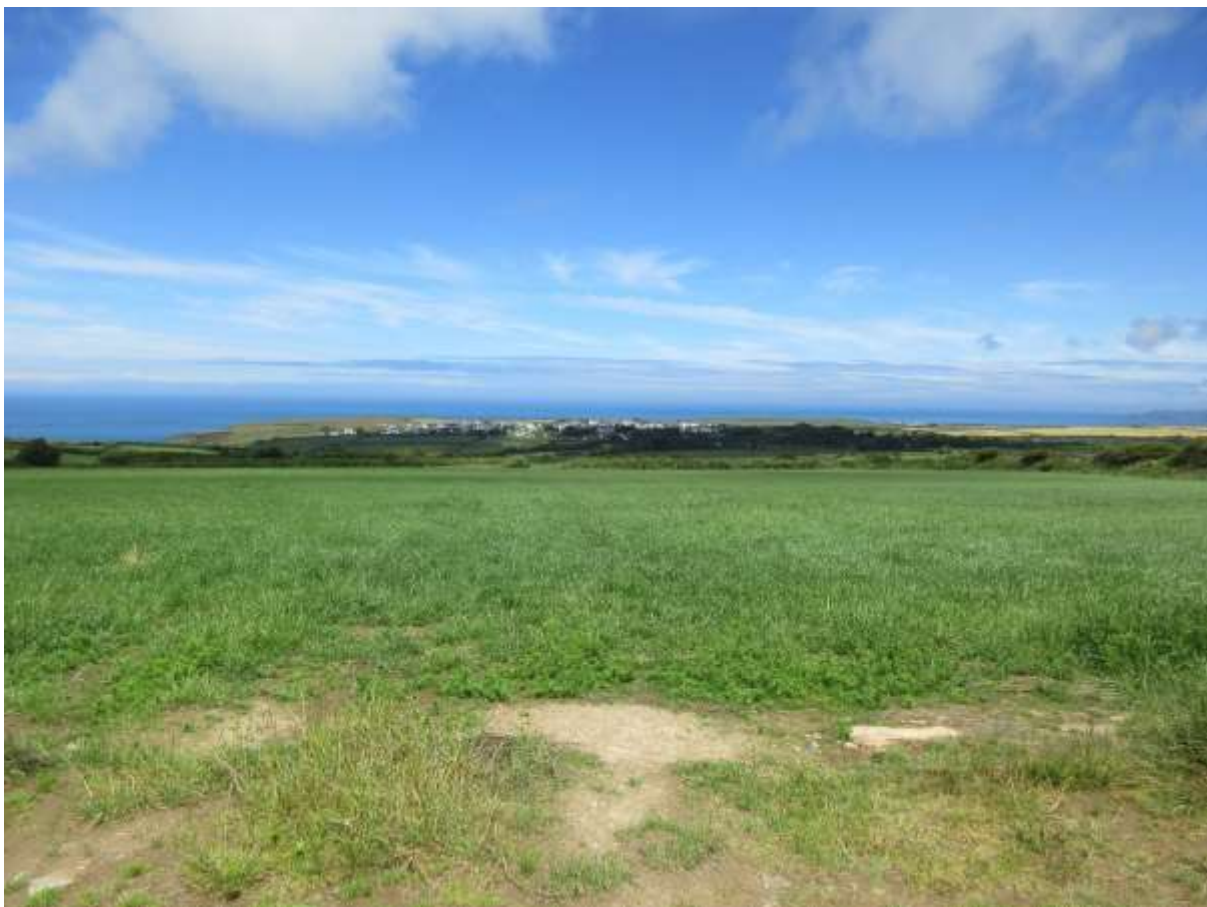
Figure 36- view from Llannon