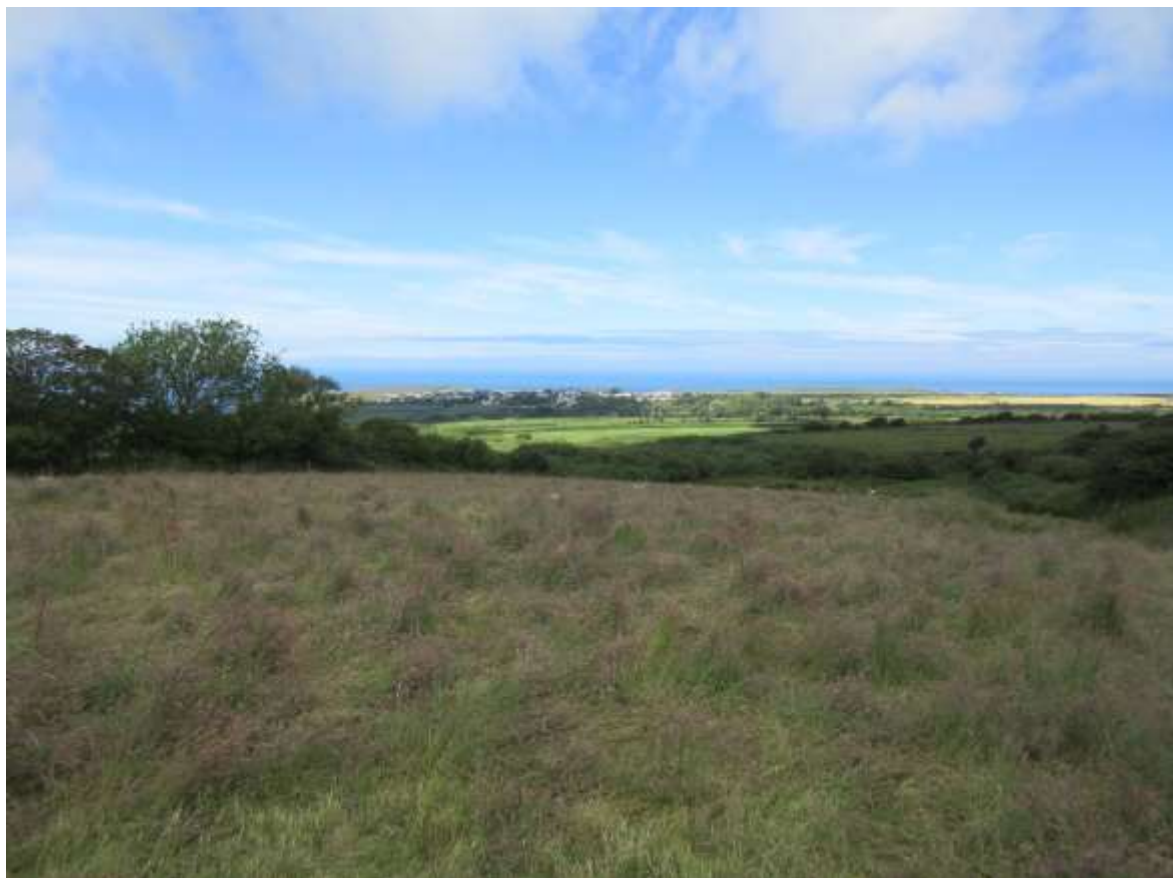
Figure 10 - view over Trefin from Llannon