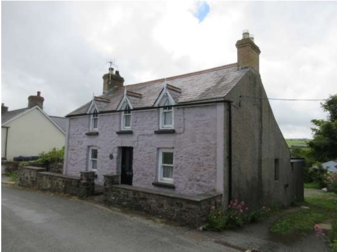
Figure 3 - positive building