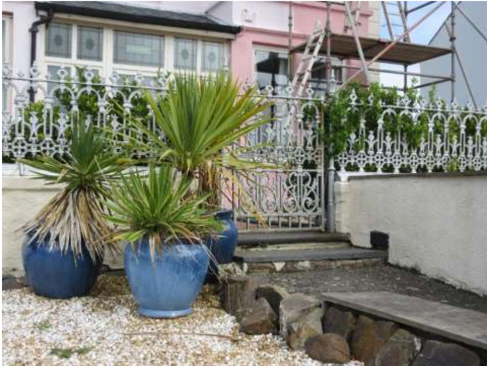
Figure 32 - Edwardian railings