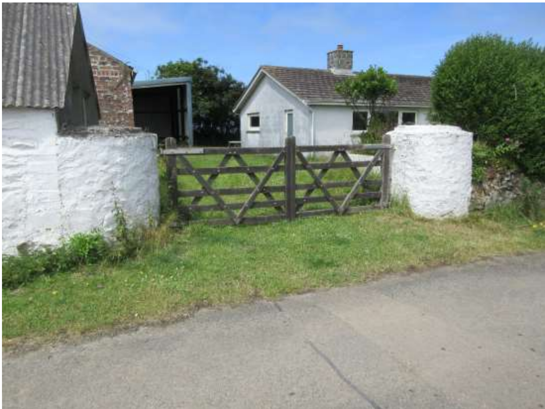
Figure 33 - traditional stone 'joms'