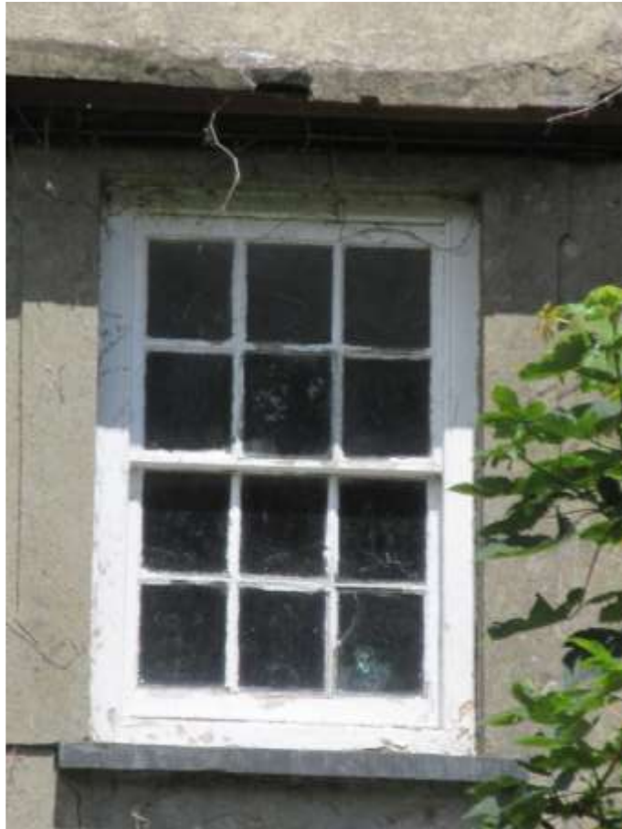
Figure 18 - early C19 12-paned sash