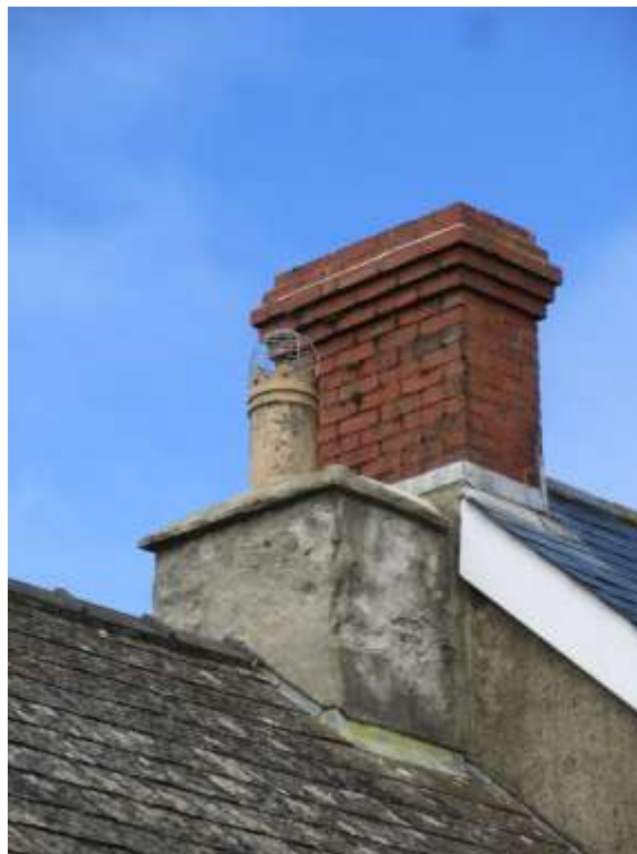
Figure 29 - juxtaposition of stone and later brick stacks