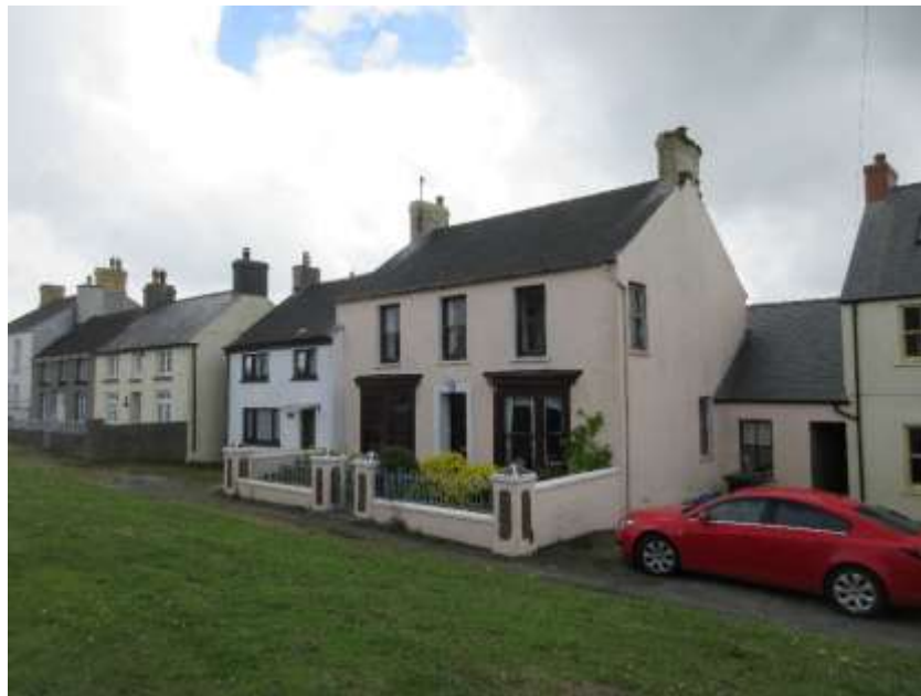
Figure 7 – essential open area