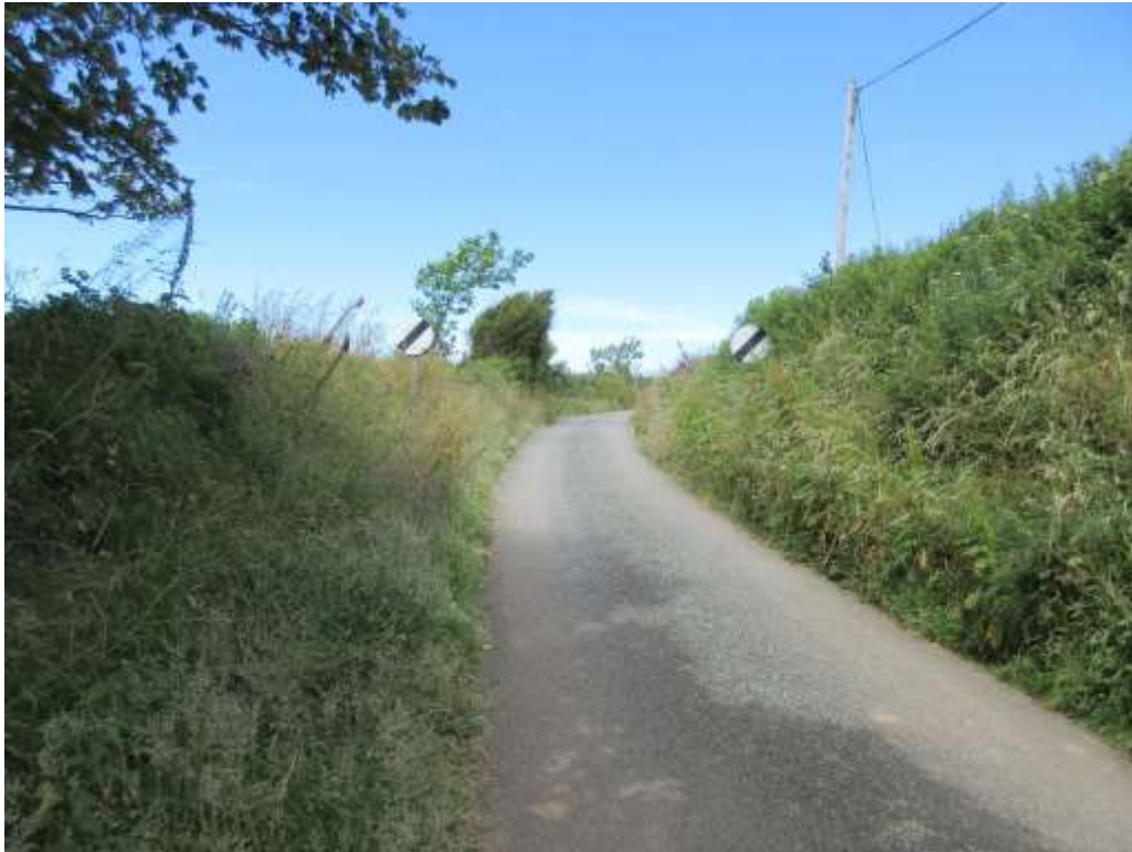
Figure 34 - windswept hedge