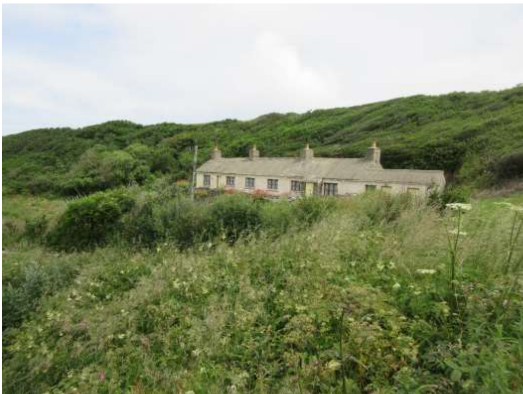
Figure 35 - Y Cwm