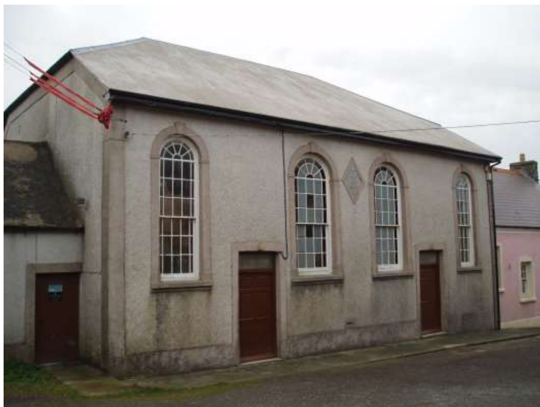
Figure 1 - Trefin Calvinistic Methodist Chapel - listed Grade II

of their contribution to the streetscape. The conservation area is predominantly residential in character.