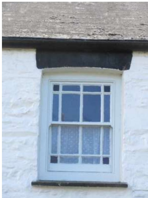
Figure 19 - marginal-glazed sash