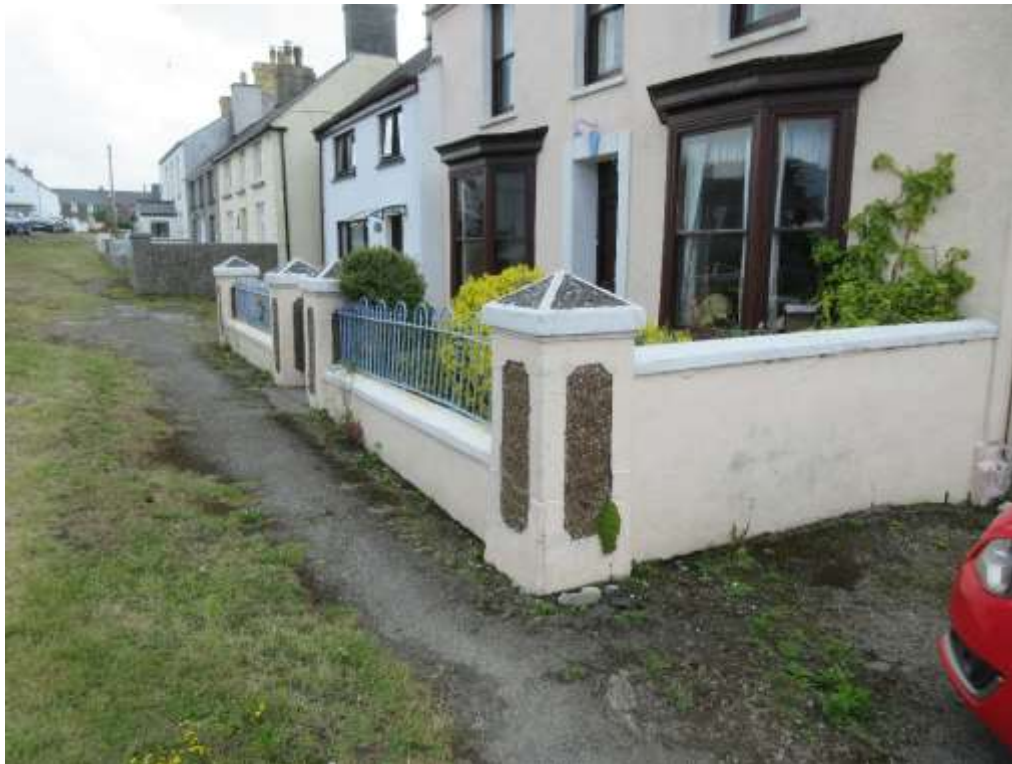
Figure 5 - historic curtilages