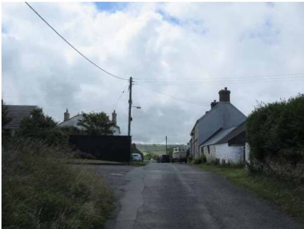
Figure 15 - wirescape, North End