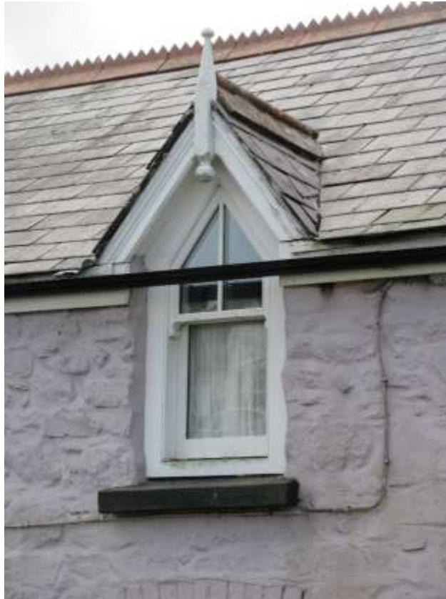
Figure 22 - triangular dormer sash