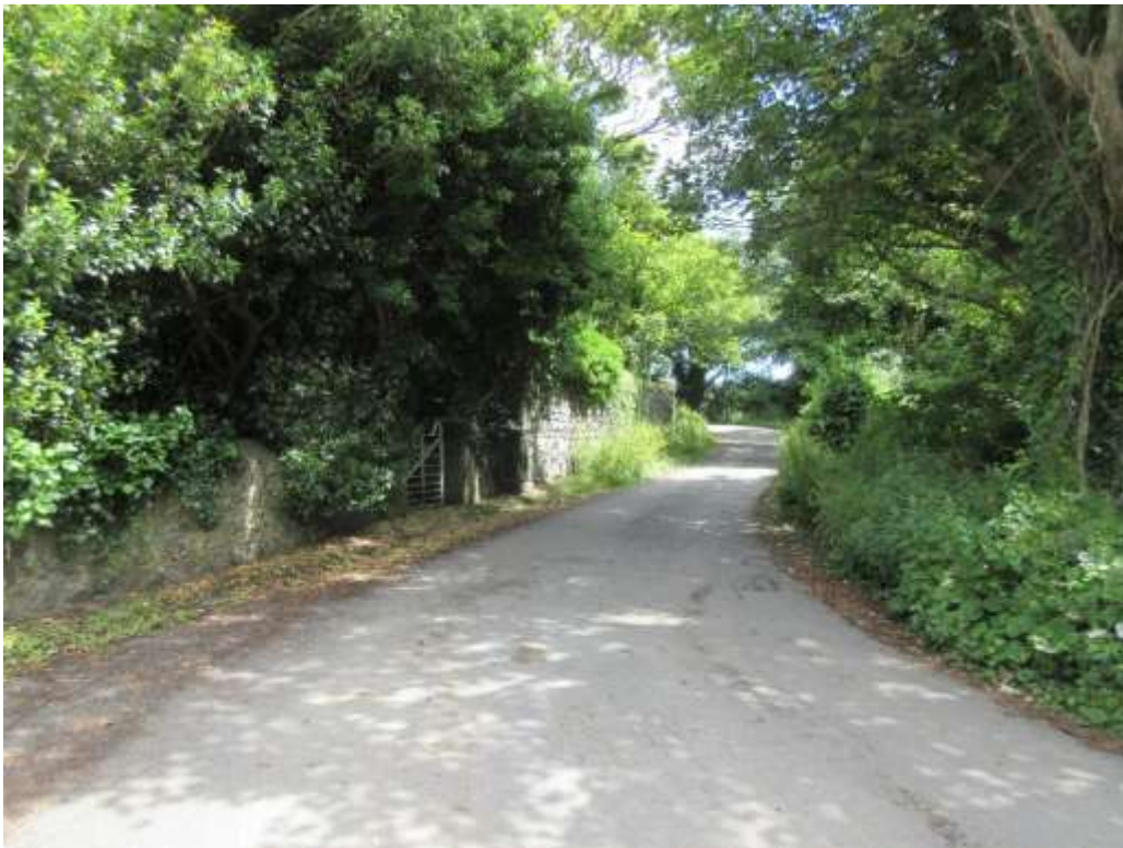
Figure 12 - trees, Cartlett