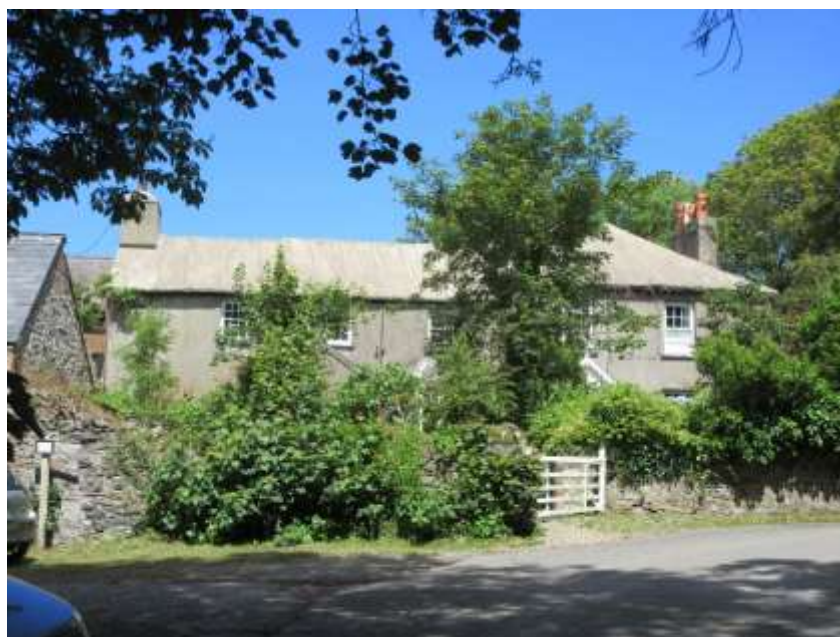
Figure 27 - grouted roofs