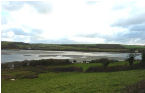
Middle section of the estuary