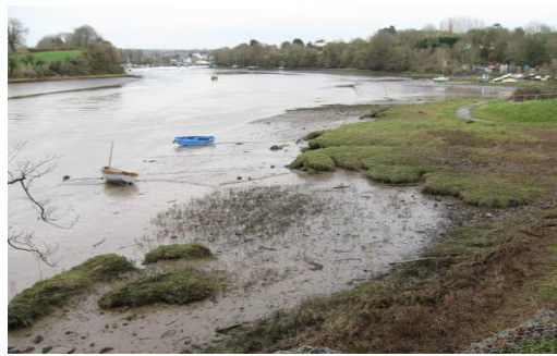
Approaching Cardigan