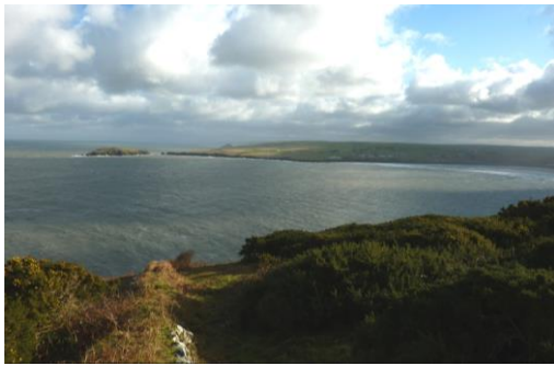
The outer bay looking from Cemaes Head