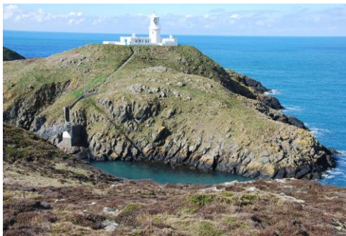
Strumble Head lighthouse showing cliffs in calm weather