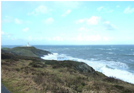
Strumble Head and lighthouse in high winds