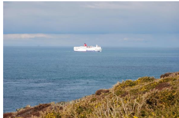
Irish ferry offshore approaching Fishguard near Strumble Head