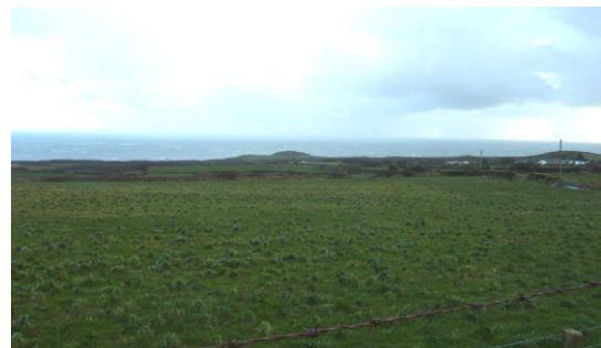
Looking from near Llanwnda to Crincoed Point