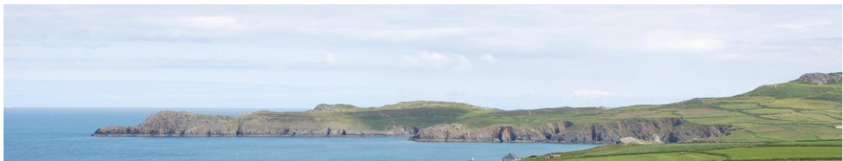
St David's Head looking across Whitesands Bay from Carn Rhosson