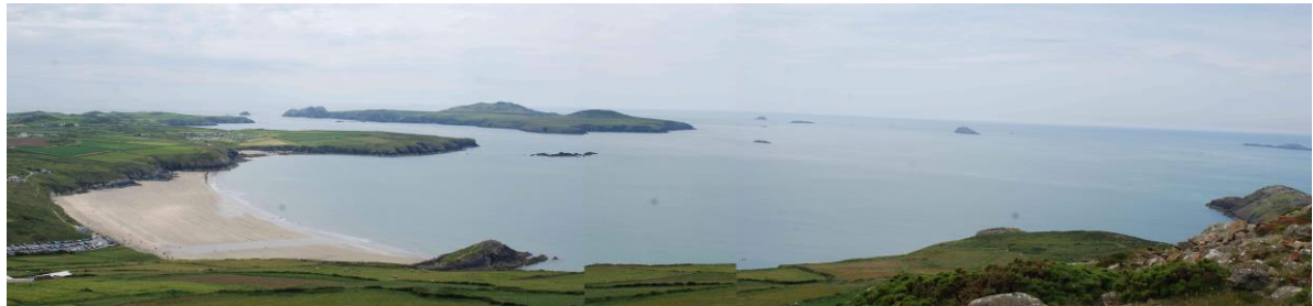
View of the Bay and Ramsey Island from Carn Llidi