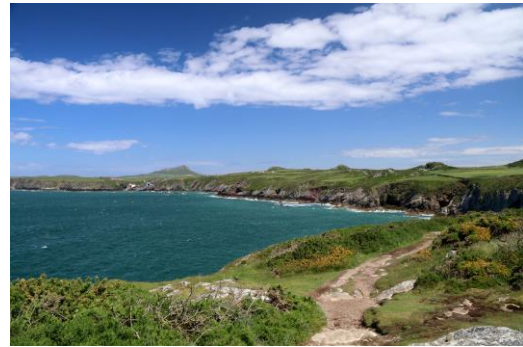
Mainland coast looking north towards St Justinians with Carn Lidi in the background (Lyndon Lomax)