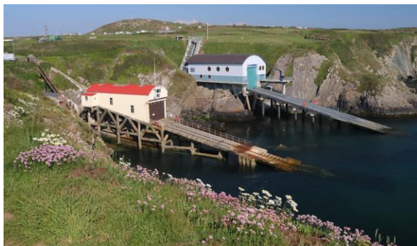
St Justinians with intermediate and new lifeboat stations with Carn Rhosson in the background (Lyndon Lomax)