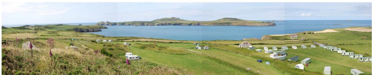
Ramsey Island and Sound viewed from Carn Rhosson (note new lifeboat station is not shown in this 2013 photo)