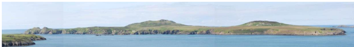
Ramsey Island from the east