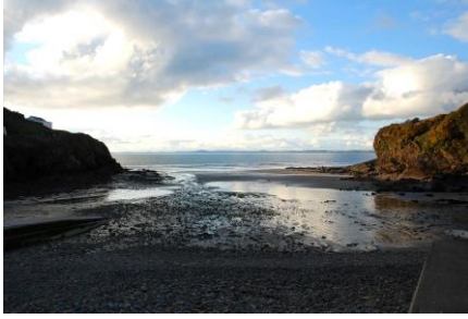
View from Little Haven across St Bride's Bay