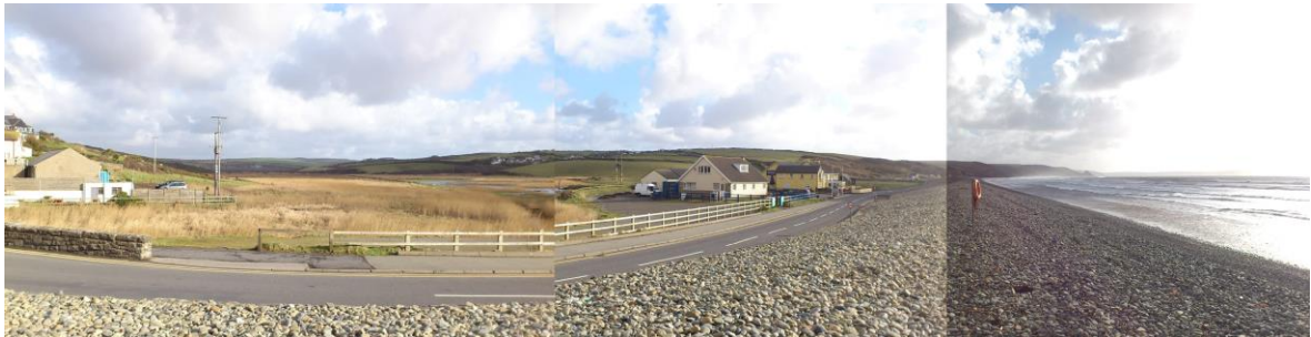
Looking south from Newale