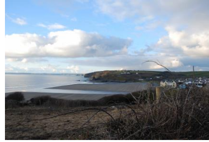
View across Broad Haven beach