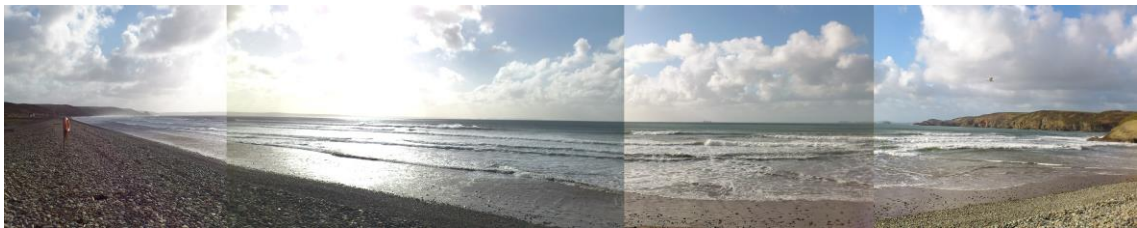
St Brides Bay from Newgale