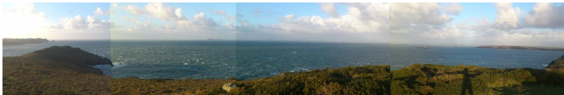
St Brides Bay from Nab Head with Skomer to the left