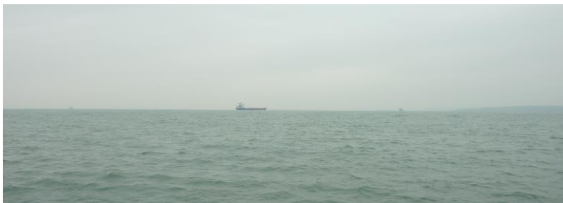
— View from sea north of Skomer