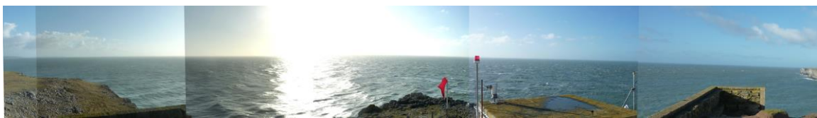
Area out to sea from St Govan's Head (in SCA35)