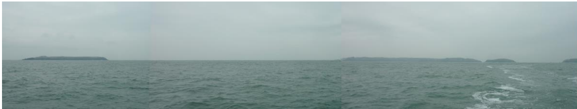
Area viewed between Skokholm and Skomer at sea