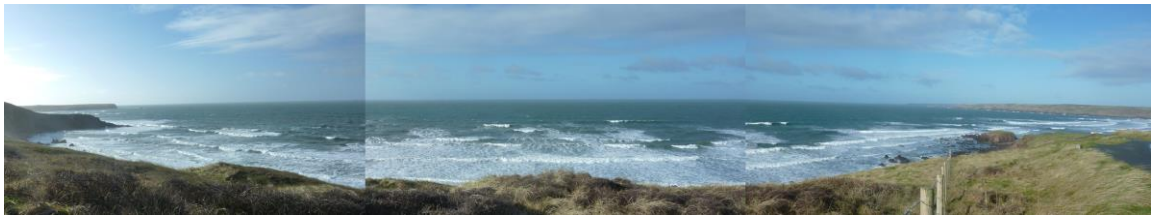
Area out to sea from Freshwater West (in SCA34)