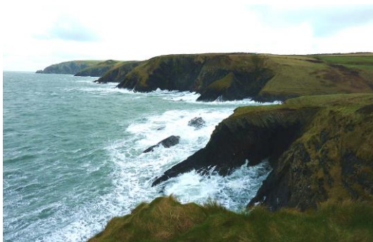
Looking north east from Careg Wylan