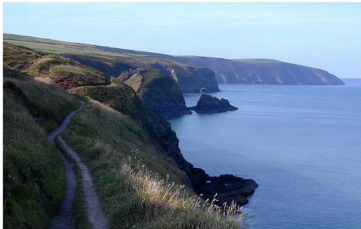
Looking towards Newport Bay