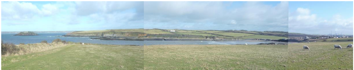
Panorama looking north over Angle Bay, refinery visible on right