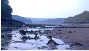
Sandyhaven Pill