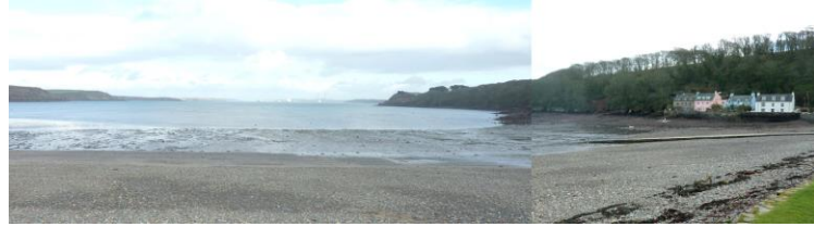
Dale Roads with refinery in distance