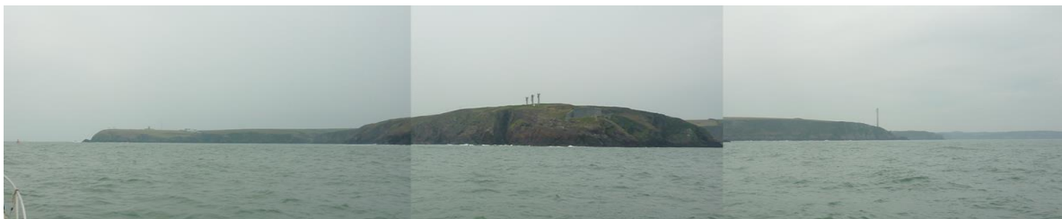
In the mouth of the Sound approx 500m from shore