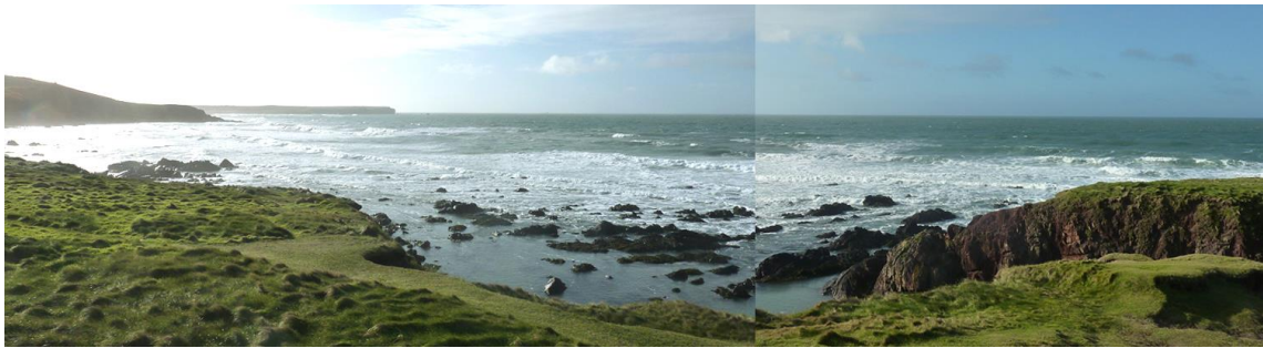
looking south from Little Furznip