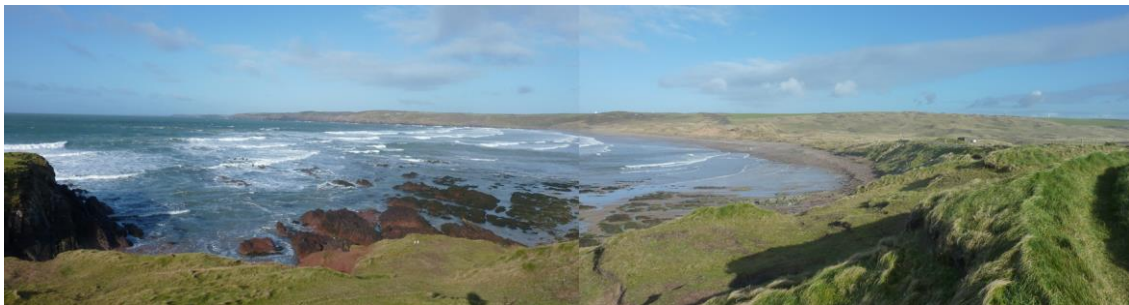
looking north east from Little Furznip