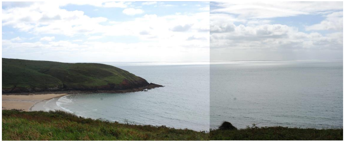
Manorbier beach and the Priest's Nose