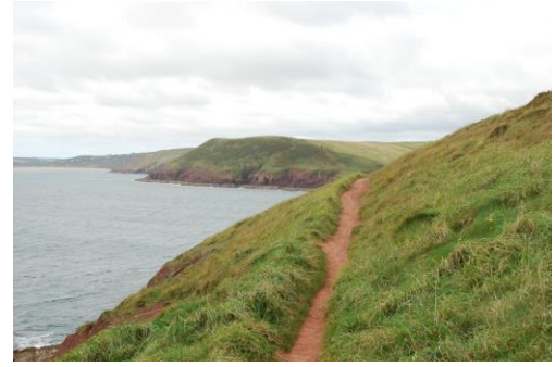
Cliff path on the Priest's Nose looking west