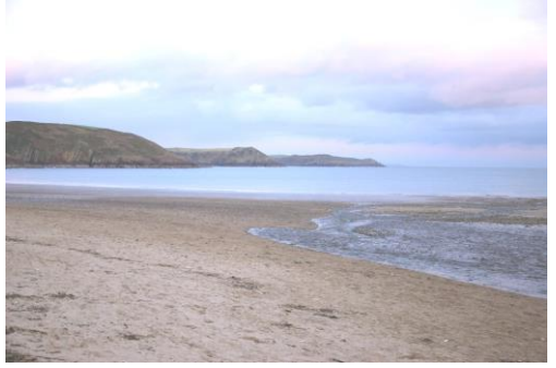
Freshwater East looking east