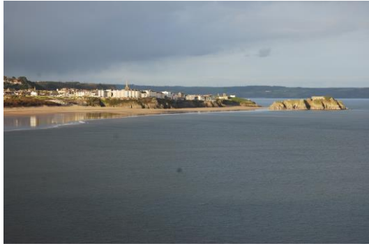
Tenby with spire from the south