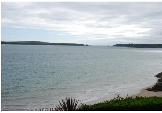
View across to Caldey island from South Beach