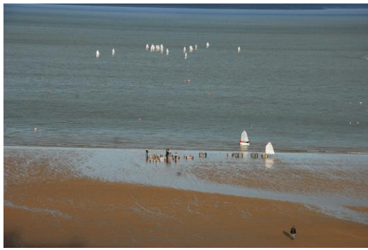
Tenby- sailing dinghy activity off North Beach