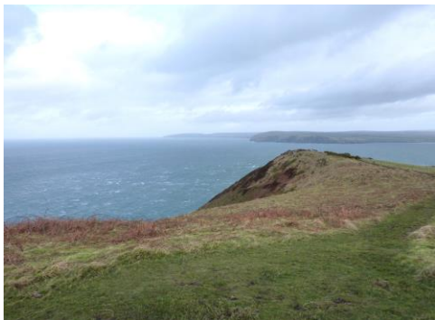
Looking north east from Dinas Head (note disturbed seas of headland)