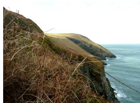
Cliffs on Dinas Head