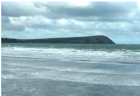
Dinas Head from Newport Sands