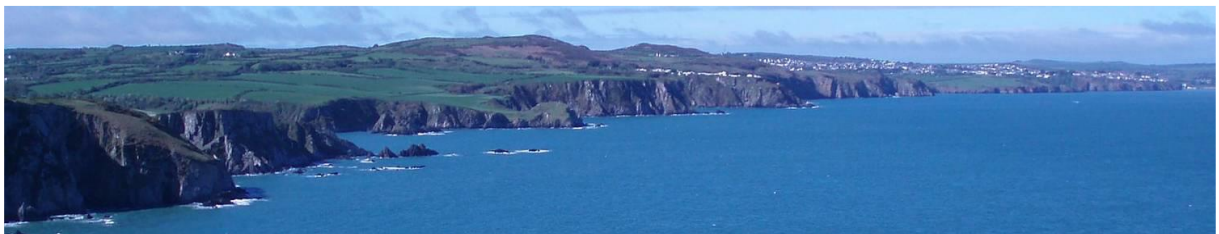
Looking from Dinas Head south-west towards Fishguard