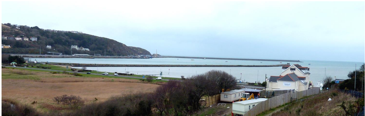
Harbour and ferry terminal at Goodwick