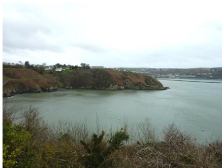
Harbour with Fishguard above and Goodwick in distance