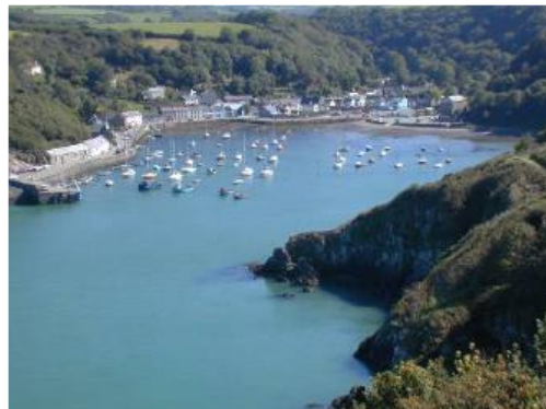
Old Fishguard harbour and Lower Town