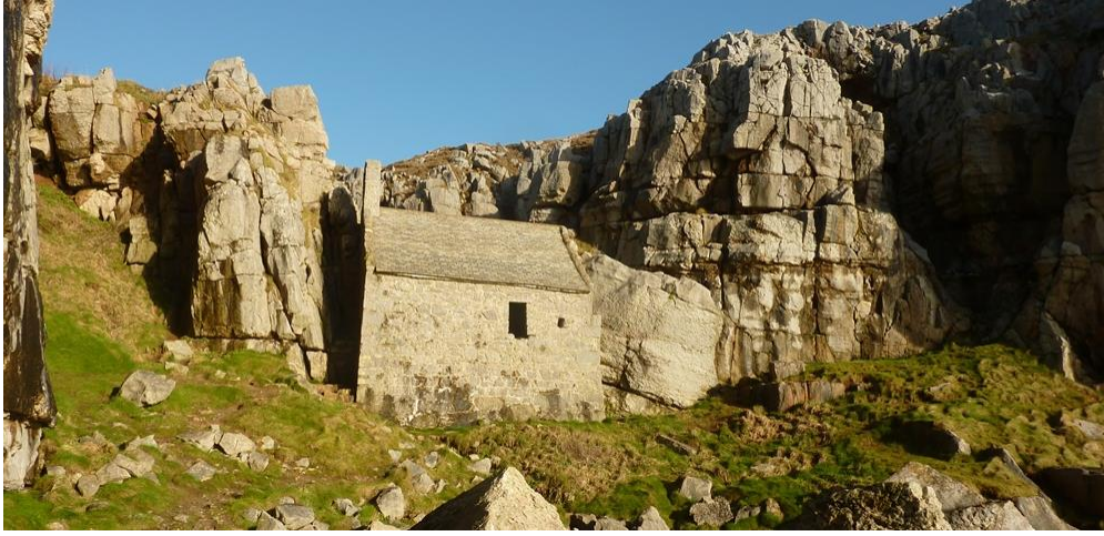
St Govan's Chapel