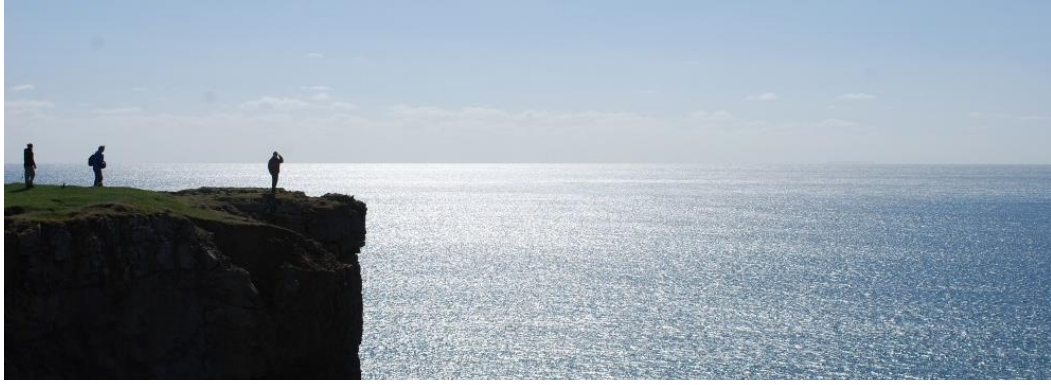
Stackpole Head- panoramic views