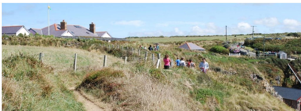
Coast Path at St Justinians- a popular stretch