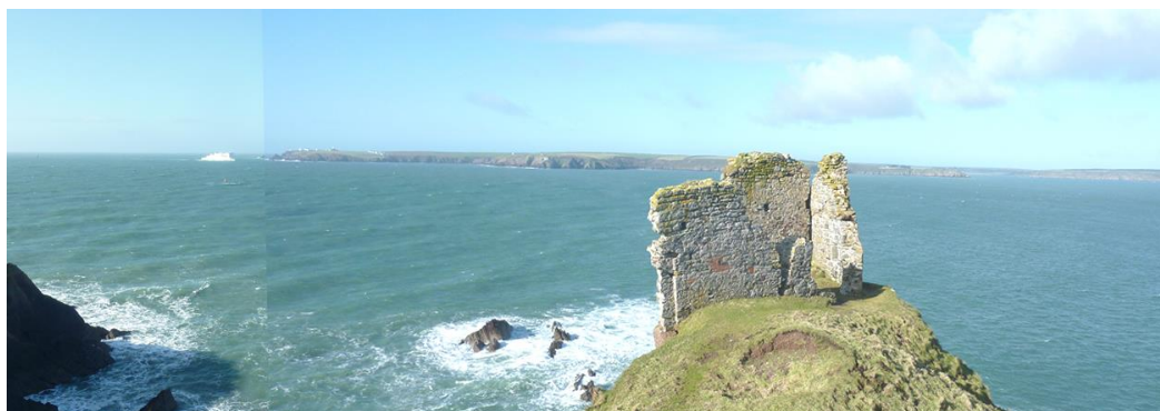
The mouth of Milford Haven

an important role in the Western Seaboard Defences strategy, when there were twelve airfields in active operation. Remains are still apparent such as the look out on Carn Llidi. Pembroke Dockyard provided a base for military flying boats from 1930 to 1959 and there was a long-standing Army presence in Pembroke Dock with barracks at various locations including West Llanion, Barrack Hill and Pennar Point.