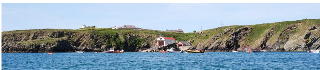
St Justinians from Ramsey Sound