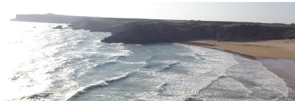
Waves at Broadhaven (South)