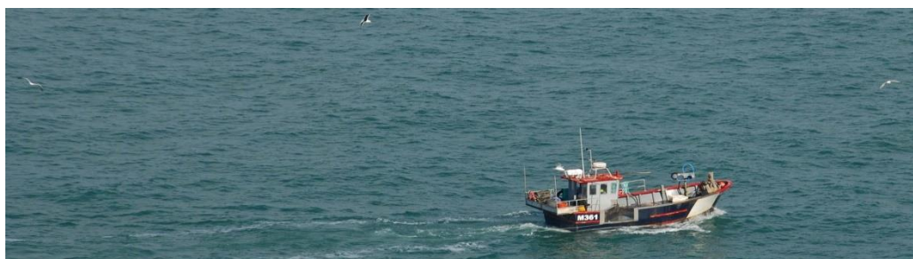
Potting fishing vessel off Strumble Head

as crab and lobster. This results in pots being found around practically any rocky shore.