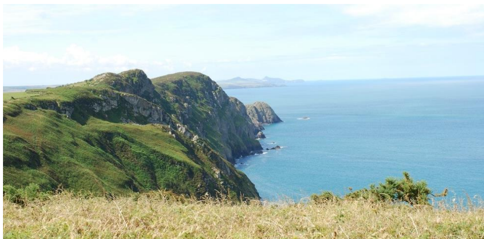
High cliffs at Penbwchdy