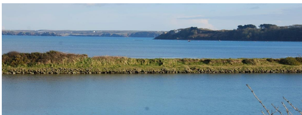
Lagoon at Dale