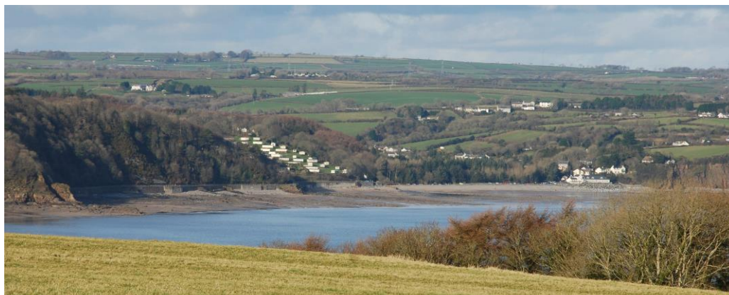
Caravans at Wiseman's Bridge

invented in the area. The intensity of use is also determined by school holidays as well as the weather.