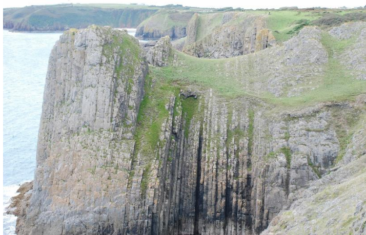
Carboniferous limestone cliffs: Whitesheet Rock

3.7 Devonian sedimentation continued in red beds, representing sediment deposited in rivers and on floodplains as the mountains eroded. The Carboniferous saw a return to marine conditions, with the Carboniferous Limestone laid down with shoals and lagoons (rich in corals, brachiopods). The Limestone forms prominent headlands and is exposed in steep coastal cliffs in south Pembrokeshire (e.g. Linney Head at 40mAOD high, Trevallen, Stackpole at 35mAOD high). This limestone coast displays distinctive erosion features such as stacks, caves, arches and blowholes. In mid to late Carboniferous times sedimentation changed to sandstones and mudstones of rivers and delta plains vegetated by giant ferns and horsetails. The peat swamps form the source for coals of the Coal Measures (Pembrokeshire Coalfield). Further continental collision led to the uplift resulting in east-west folds and faults, well seen in south Pembrokeshire (e.g. Ladies anticline at Saundersfoot, Stackpole, West Angle Bay).