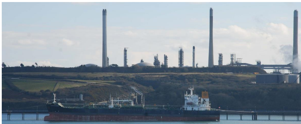
Milford Haven- refinery