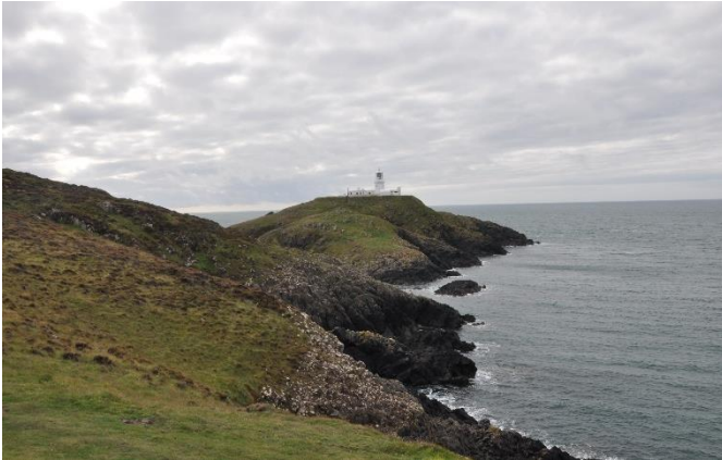
Strumble Head LCA 21

3.7 Woodland on the exposed headlands, including Carn Llidi (LCA 16), Strumble Head (LCA 21), Dinas Head (LCA 24), and Cemaes Head (LCA 25) is limited to small groups of trees within the farmed landscape, or concentrated in the shelter of the incised stream valleys which flow to the coast. Field boundaries are often devoid of trees, except in inland areas away from the coast.