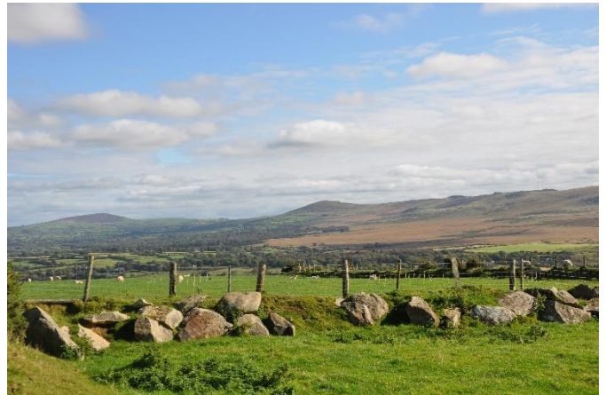
Preseli Hills LCA 27

3.5 The upland areas of the Preseli Hills (LCA 27) and Carningli Hills (LCA 22) also have extensive woodlands concentrated on the lower slopes, including coniferous plantations in the Preseli Hills. However, this woodland makes up less than 10% of the total land cover of the LCAs due to their characteristically open and exposed higher slopes. Scattered scrub is characteristic of the steep upper slopes, at the transition to the open upland areas. Small woodlands trace the course of minor watercourses and contribute to the landscape pattern of pastoral fields and woodland on lower slopes.