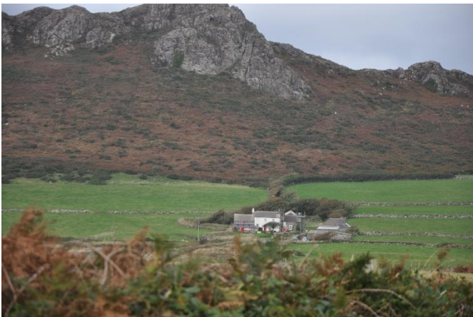
Carn Llidi LCA 16

3.7 Woodland on the exposed headlands, including Carn Llidi (LCA 16), Strumble Head (LCA 21), Dinas Head (LCA 24), and Cemaes Head (LCA 25) is limited to small groups of trees within the farmed landscape, or concentrated in the shelter of the incised stream valleys which flow to the coast. Field boundaries are often devoid of trees, except in inland areas away from the coast.