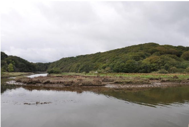
Daugleddau Estuary LCA 26

3.4 There are marked differences in woodland coverage within the National Park, with heavily wooded areas concentrated in the river valleys and estuaries. This includes the river valleys of the Gwaun and Nyfer (LCA 26) where woodland cover makes up over half the current land cover (52.6%), and along the estuaries at Stackpole (LCA 5) with 34% and Daugleddau (LCA 28) with 20%. Woodland cover along the Brandy Brook (LCA 13) and the Solva Valley (LCA 14) varies between 20% and 7.6% respectively. Riverside