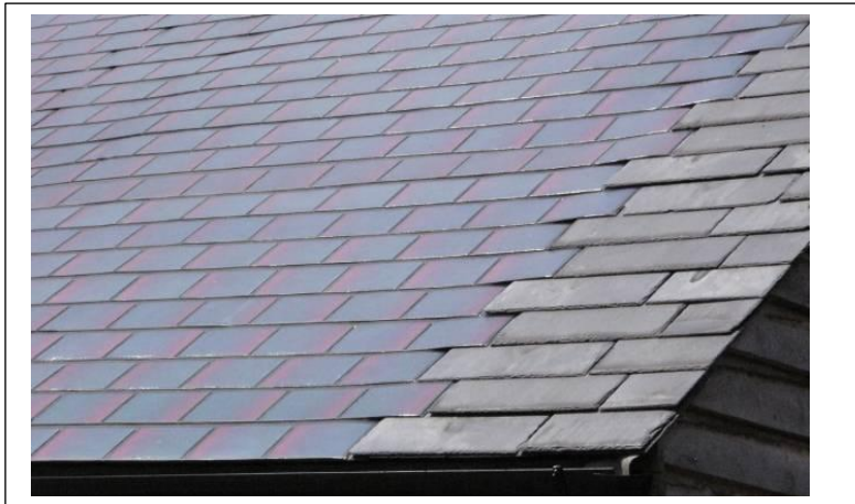
Retrofit solar PV panel