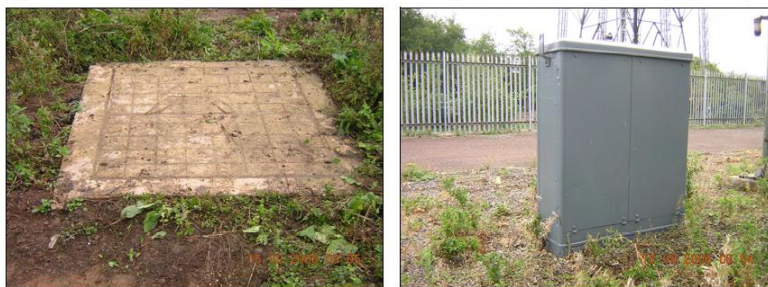
Illustration of hole boring for long distance cabling (top) and of below and above ground cable connection chambers (bottom) 8

Typical cross-bonding arrangements involve either a buried pit with a manhole or an above ground pillar