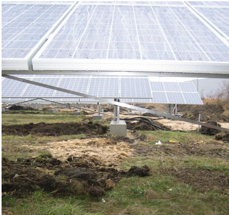
Installed solar array near Berlin, Germany