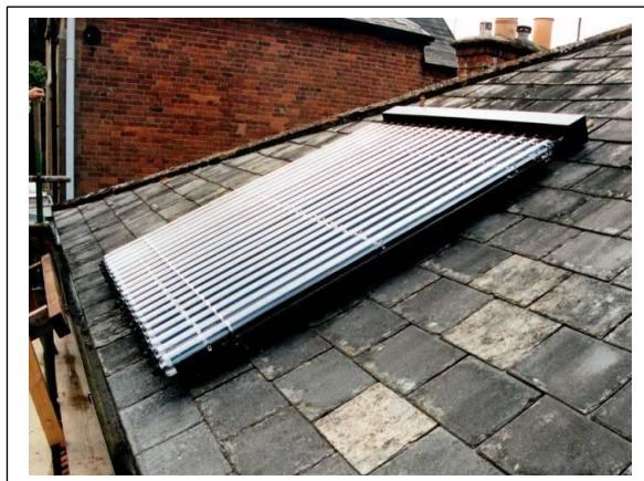
Solar hot water panel (evacuated tube system)