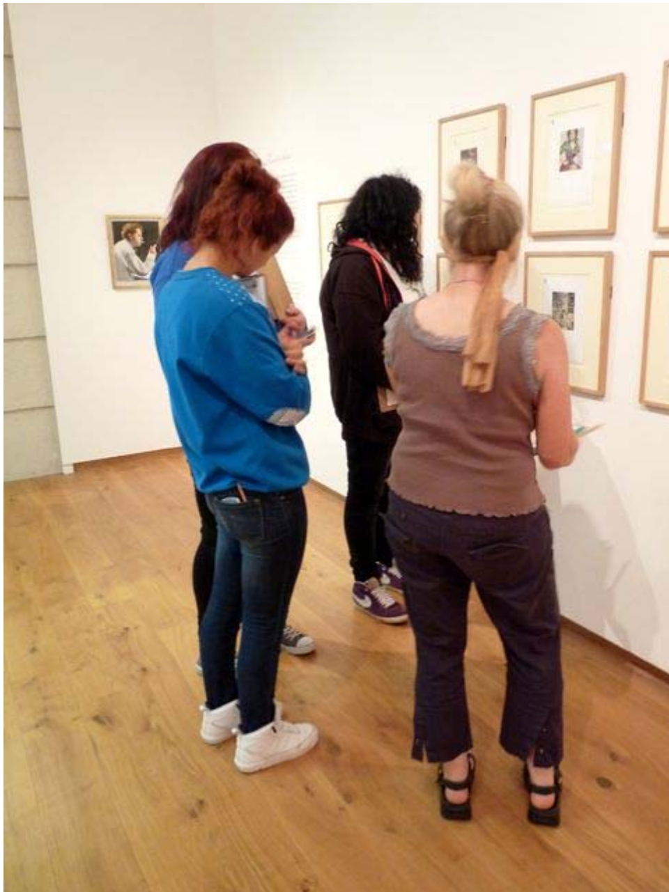
Artists as Learners