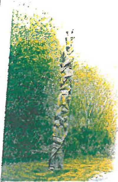
Totem in current location